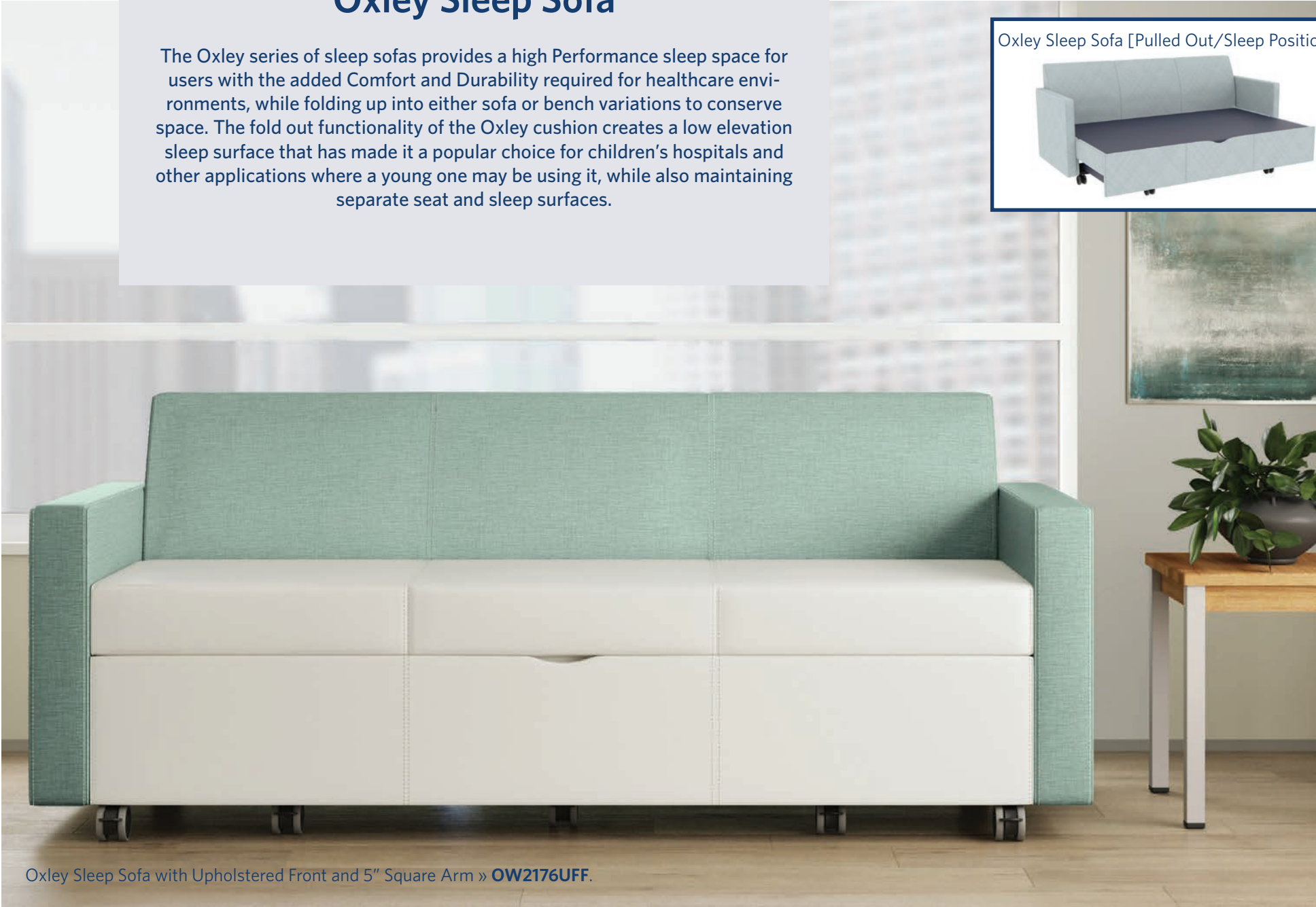
Oxley Sleep Sofa with Upholstered Front and 5" Square Arm » OW2176UFF .