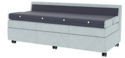
Max Sleep Sofa [Back Folded Down/Sleep Position]

The Max Sleep Sofa earns its name with its ability to maximize valuable space in healthcare environments, with a back that folds out to form a full sleep surface for users, while keeping the same original footprint. Available with many different options to enhance Performance and Comfort, such as recliner leg supports, stationary and lifting tables, numerous widths and arm sizes, among others, the Max Sleep Sofa has become one of our fastest growing series in the patient room setting.