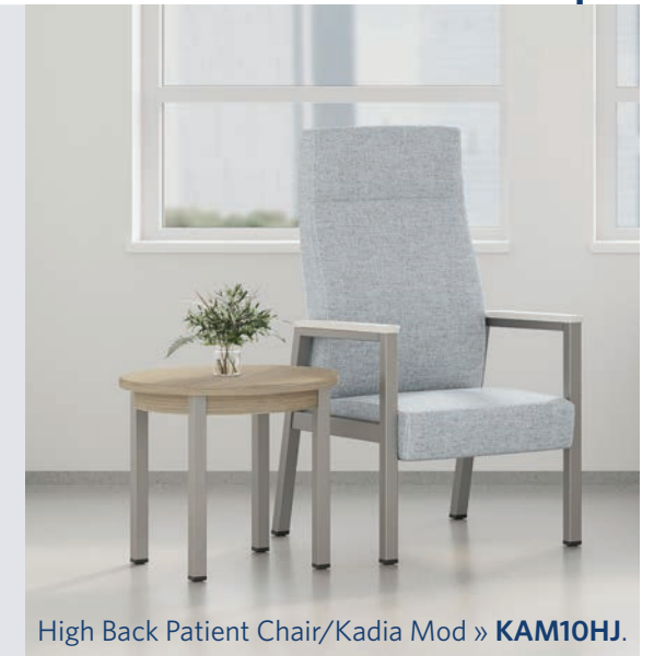
High Back Patient Chair/Kadia Mod » KAM10HJ.

The High Back Patient Chair is our open arm, metal frame modular seating designed with the shared aesthetic of our comprehensive Kadia or Koncert family of product, while incorporating the Comfort, Performance, and Durability that Knú Comfort™ is known for. The High Back Patient Chair also incorporates the same passive flex back for optimal Comfort as a standard feature, along with clean out (or wipe out area) in between the seat and back, as well as leveling glides.