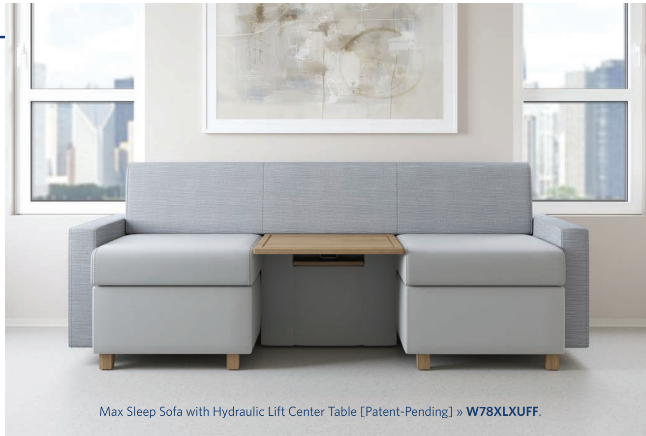
Max Sleep Sofa with Hydraulic Lift Center Table [Patent-Pending] » W78XLXUFF .