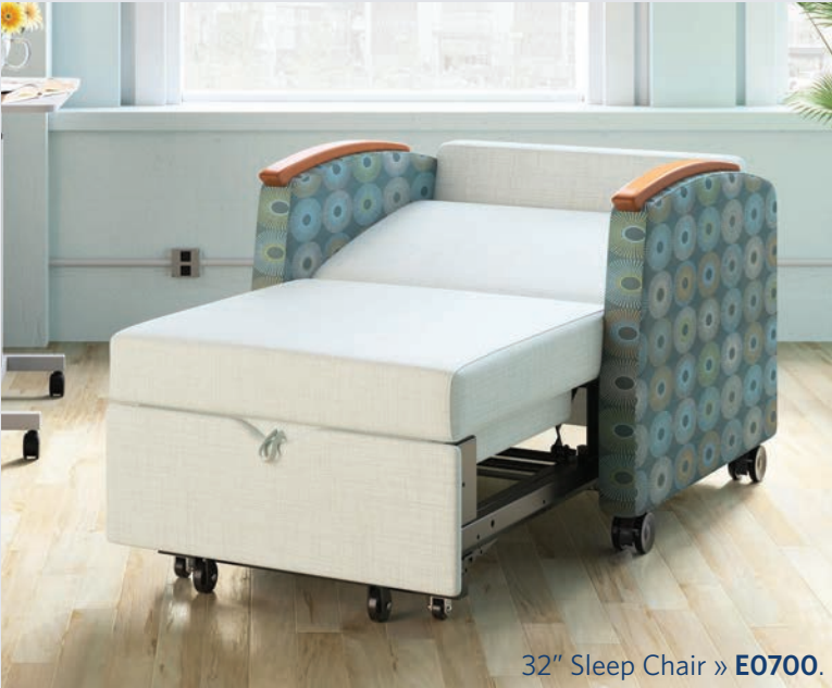
32" Sleep Chair » E0700 .