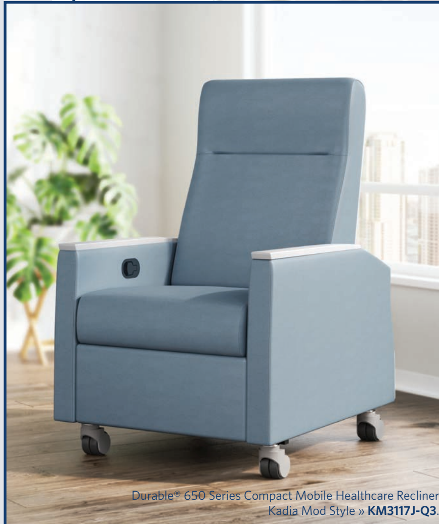
Durable® 650 Series Compact Mobile Healthcare Recliner Kadia Mod Style » KM3117J-Q3.

Featuring all of the available functionality- patented unitized mechanism (extending to a true flatbed position), 650 lb weight capacity, and near limitless option configurations to adapt to any environment- our Compact mobile healthcare recliners are standard with a tightened seat width of 22" between the arms and available models with narrow arms to allow use in smaller patient room and other healthcare settings. The optional Q3 Central Locking Casters further adjust the scale, lowering the seat height an additional inch to accommodate pediatric patients.