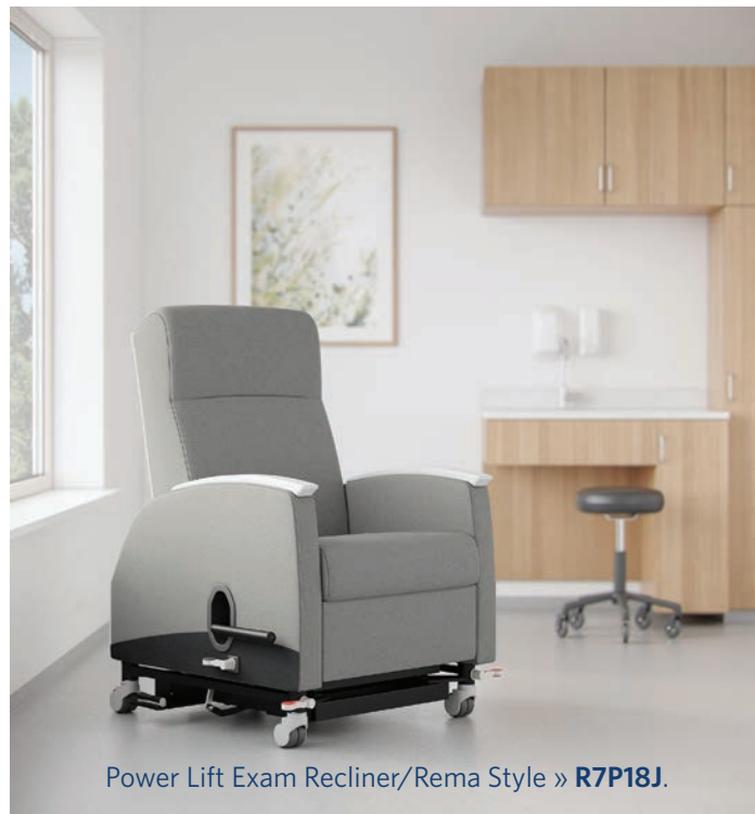
Power Lift Exam Recliner/Rema Style » R7P18J.