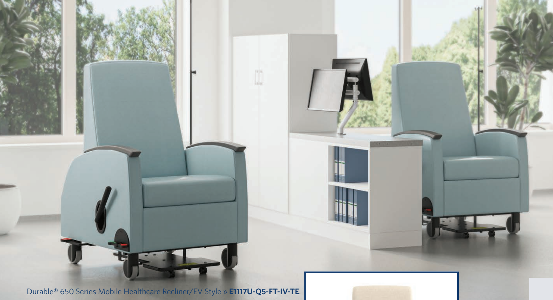
Durable® 650 Series Mobile Healthcare Recliner/EV Style » E1117U-Q5-FT-IV-TE.