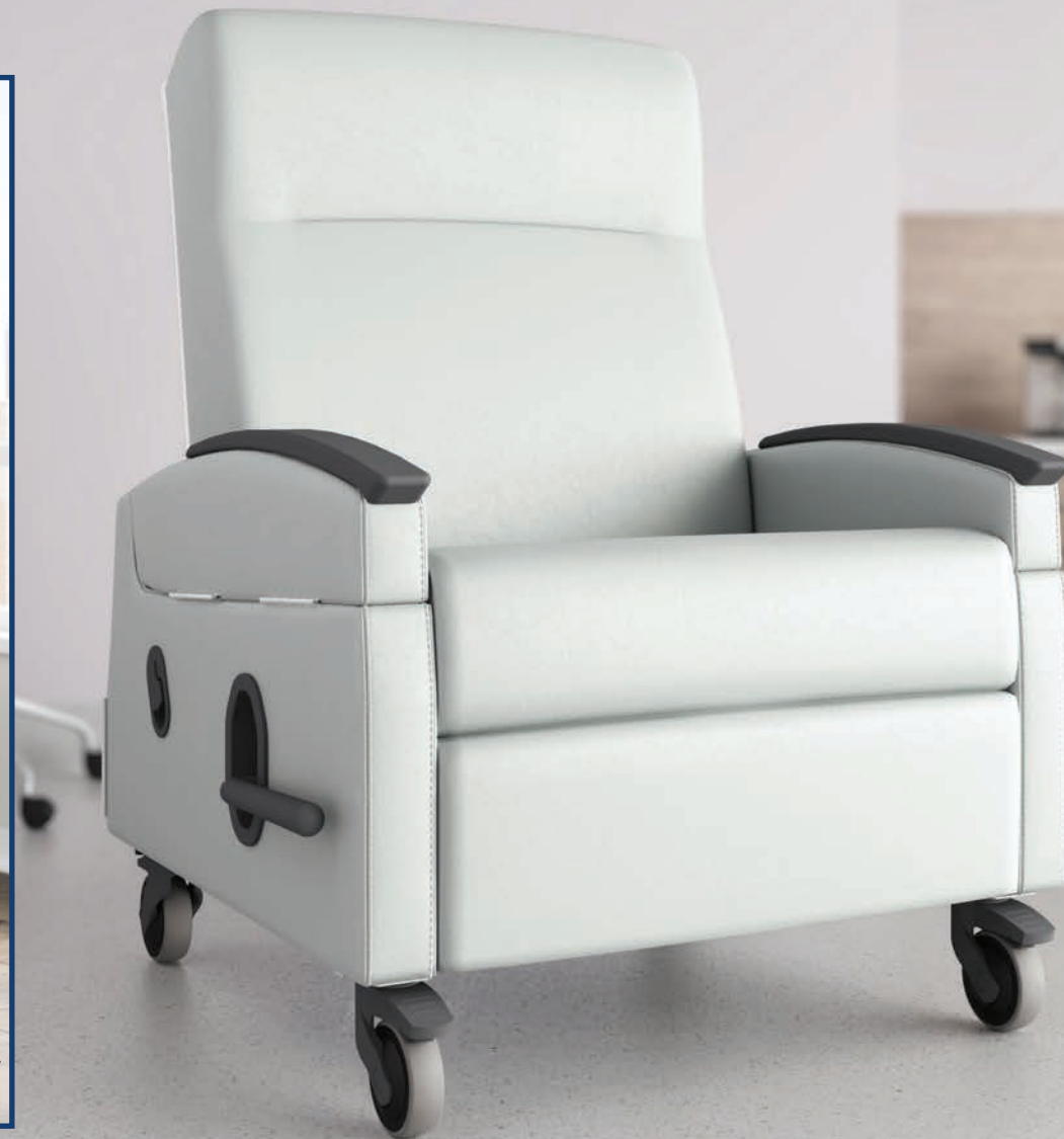
Durable® 750 Series Bariatric Mobile Healthcare Chaise Recliner with Dual Patient Transfer Arms/Rema Style » RBC1162U.

The Durable® 750 Series is the Bariatric version of our premier Durable® 650 Series of mobile healthcare recliners. Featuring a patented unitized mechanism (extending to a true flatbed position), 750 lb weight capacity, and near limitless option configurations to adapt to any environment, the Durable® 750 Series truly encapsulates our core product values of Comfort, Durability, and Performance to make it a recliner choice trusted by patients and caregivers alike. Engineered from the ground up with cleanability in mind, its removable back and lift up seat, along with the absence of entrapment areas make it a strong asset in infection control. Our legacy of Comfort combine with a passion for well-being in the Durable® 750 Series to prove beyond doubt - Comfort Heals®.