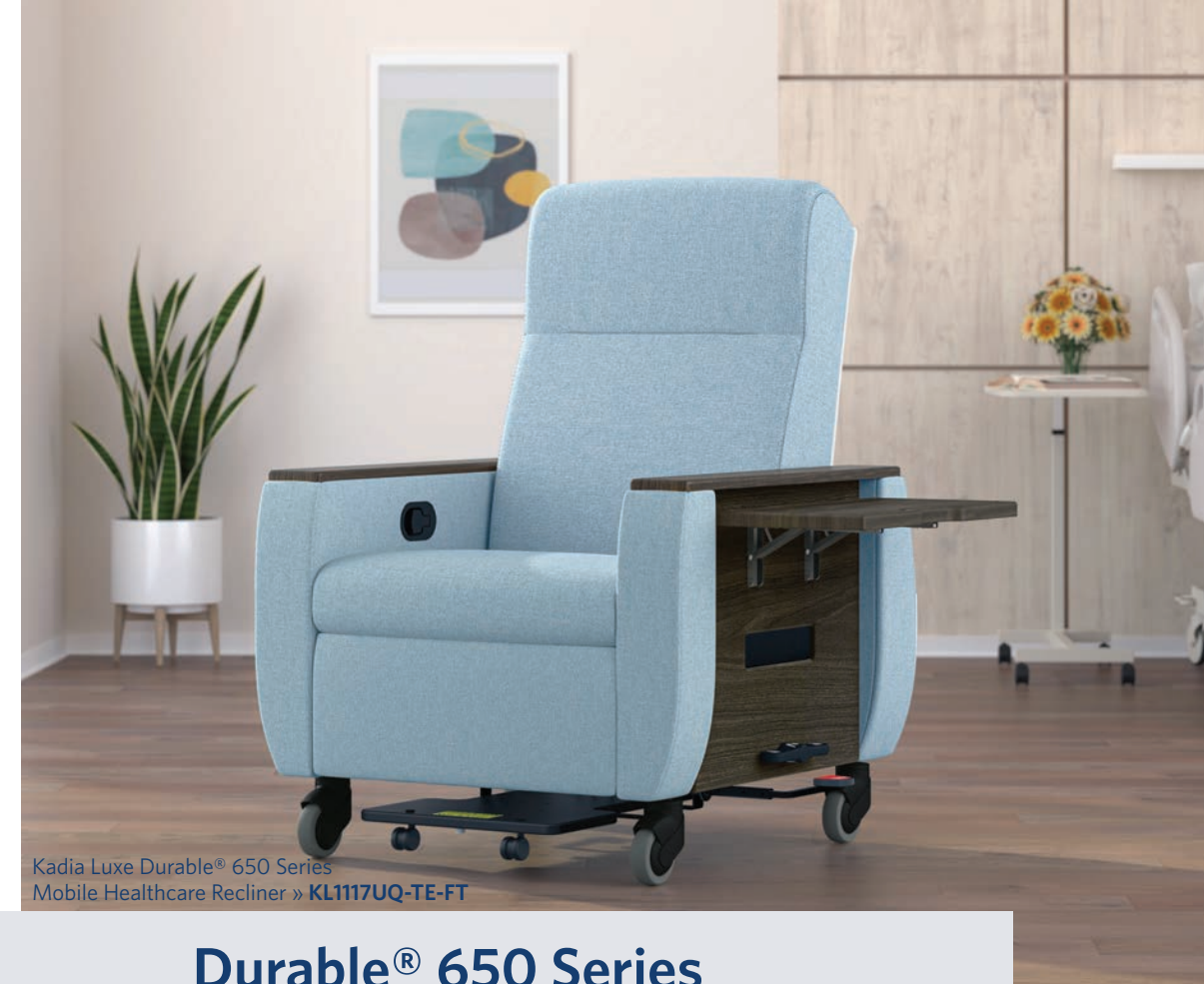
Kadia Luxe Durable® 650 Series Mobile Healthcare Recliner » KL1117UQ-TE-FT