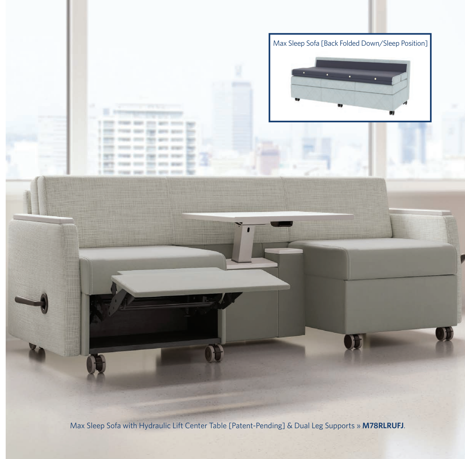
Max Sleep Sofa with Hydraulic Lift Center Table [Patent-Pending] & Dual Leg Supports » M78RLRUFJ .