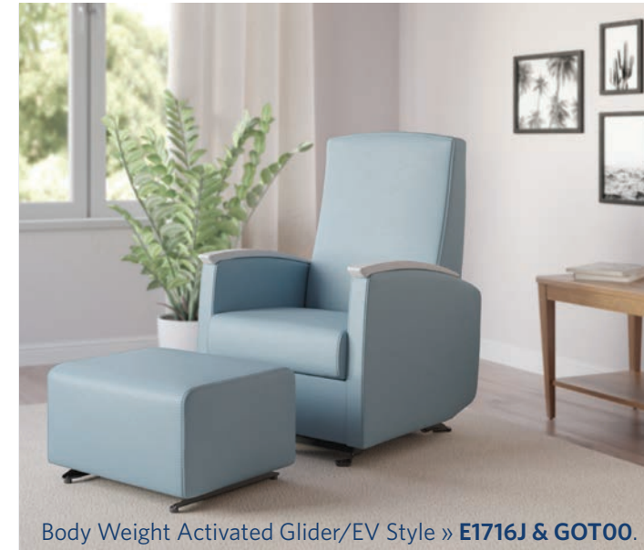
Body Weight Activated Glider/EV Style » E1716J & GOT00.