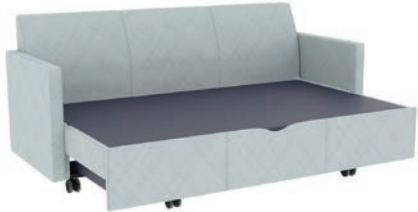
Oxley Sleep Sofa [Pulled Out/Sleep Position]

The Oxley series of sleep sofas provides a high Performance sleep space for users with the added Comfort and Durability required for healthcare environments, while folding up into either sofa or bench variations to conserve space. The fold out functionality of the Oxley cushion creates a low elevation sleep surface that has made it a popular choice for children’s hospitals and other applications where a young one may be using it, while also maintaining separate seat and sleep surfaces.