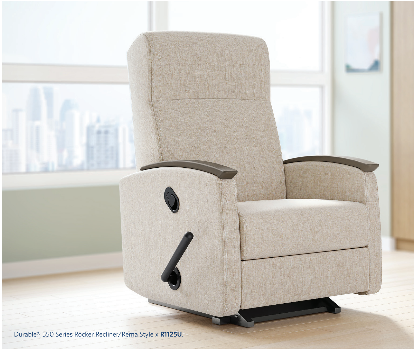
Durable® 550 Series Rocker Recliner/Rema Style » R1125U .