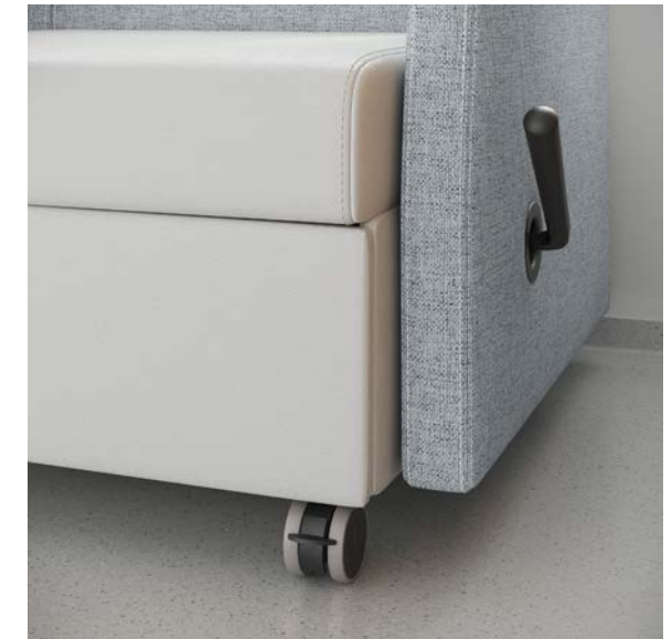
3" Dual Wheel Caster