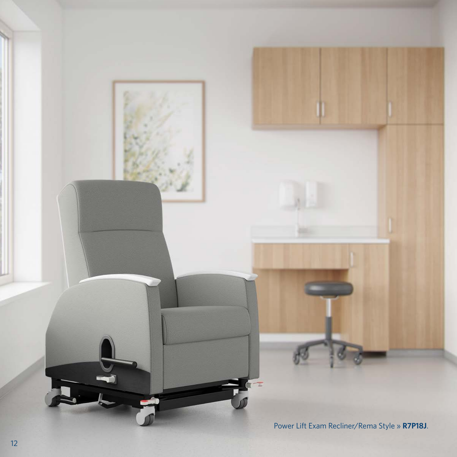
Power Lift Exam Recliner/Rema Style » R7P18J .