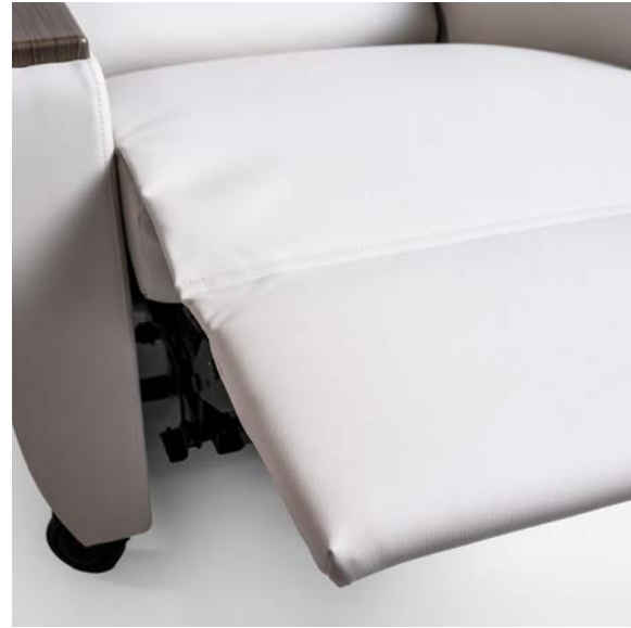
Optional Chaise Continuous Leg Support