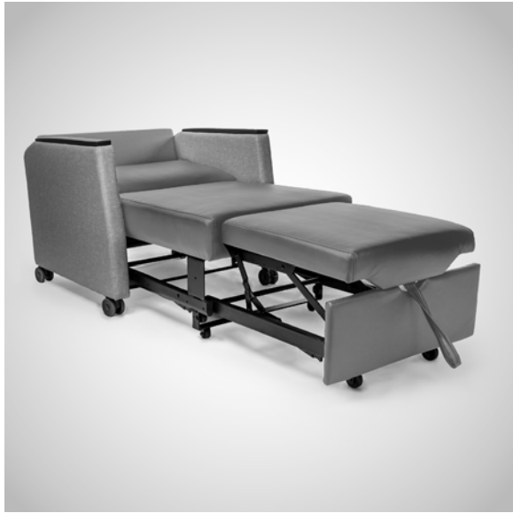
Kadia Mod Style Sleep Chair » Sleep Position