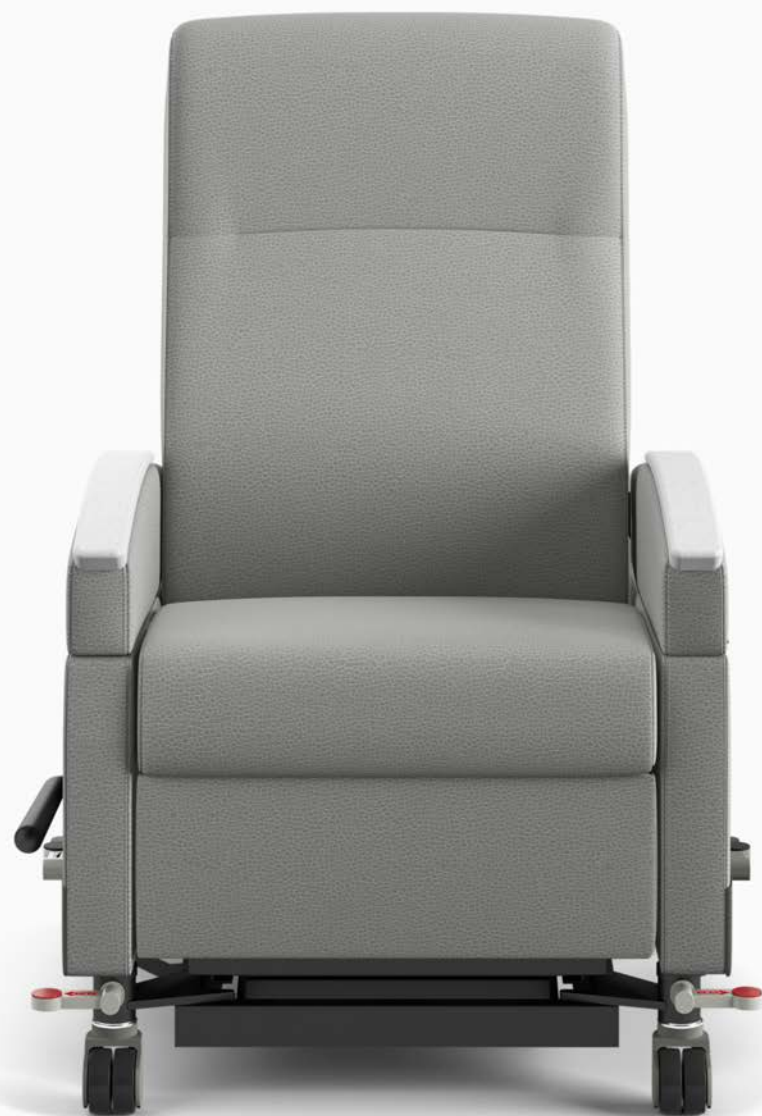
Manual Hydraulic Lift Exam Treatment Recliner with Dual Patient Transfer Arms/Rema Style » RC7M62J .