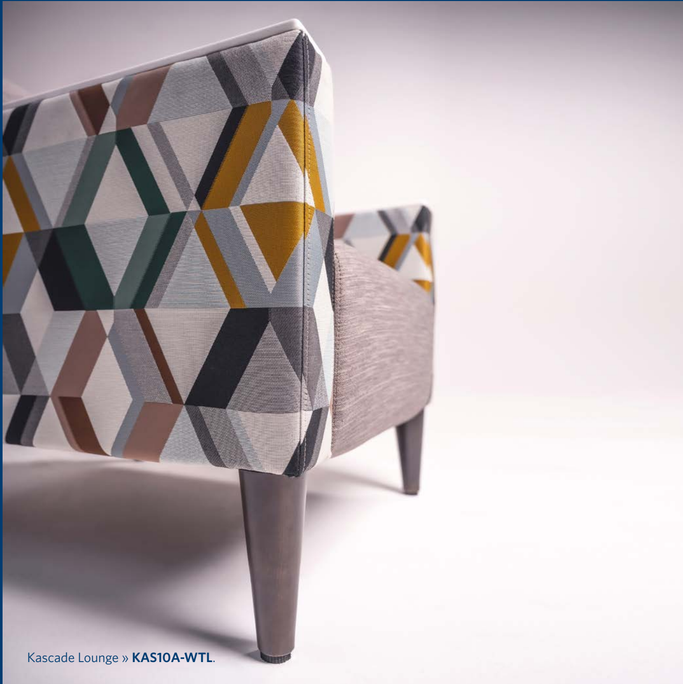
Kascade Lounge » KAS10A-WTL .