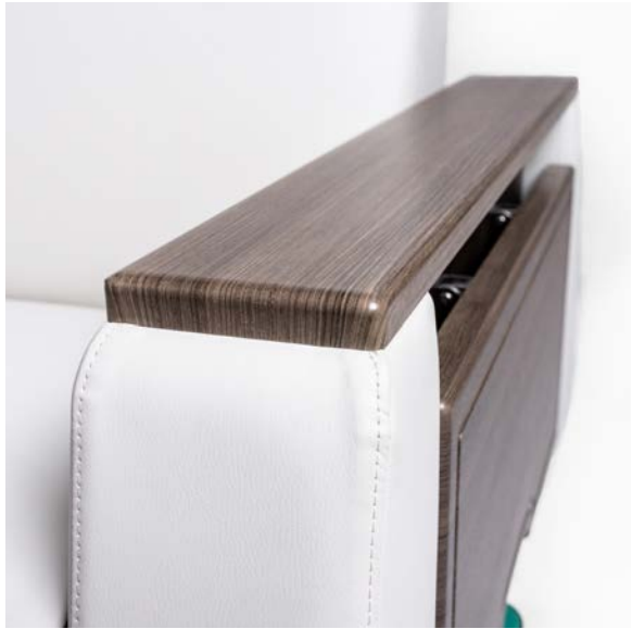
Recessed Folding Side Tray and Optional Thermofoil Arm Cap