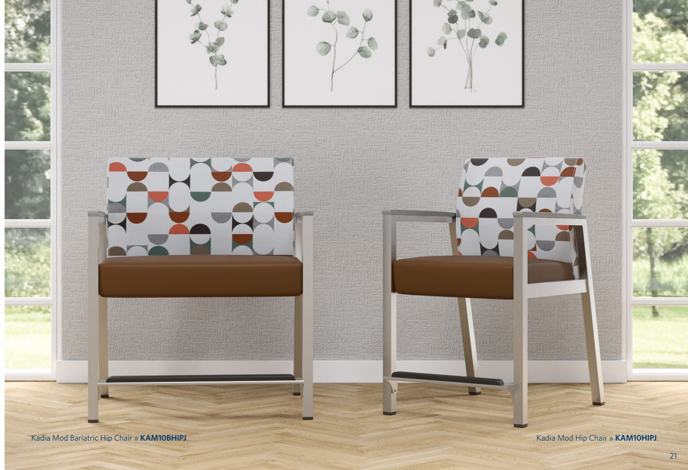
Kadia Mod Bariatric Hip Chair » KAM10BHIPJ .

We’ve introduced products in the Kadia Mod style in nearly all of our product categories, including recliners and sleep chairs, which are also complemented by the angled design of our Oxley and Max families of sleep sofas.