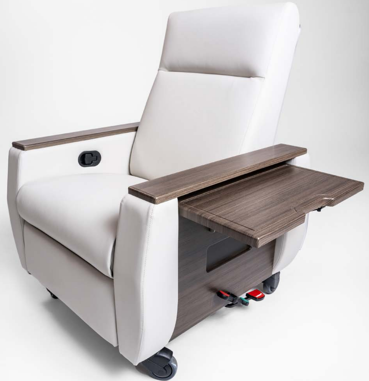
Kadia Luxe Durable® 650 Series Recliner » KLC1117TQ.

tray, as well as our central locking caster system as standard features. The design of the Kadia Luxe helps patients by providing a wider than normal arm cap, for added comfort and functionality, while assisting the caregivers by making the recliner easy to maneuver within the patient room, and since the working components are designed within the arm footprint, it prevents the handle, or the locking caster system, or the tray from interacting with any beds, bedside cabinets, sleep sofas, or doorways, making the unit easier to use and also transfer patients to procedures as well as incorporating the comfort that we are known for.