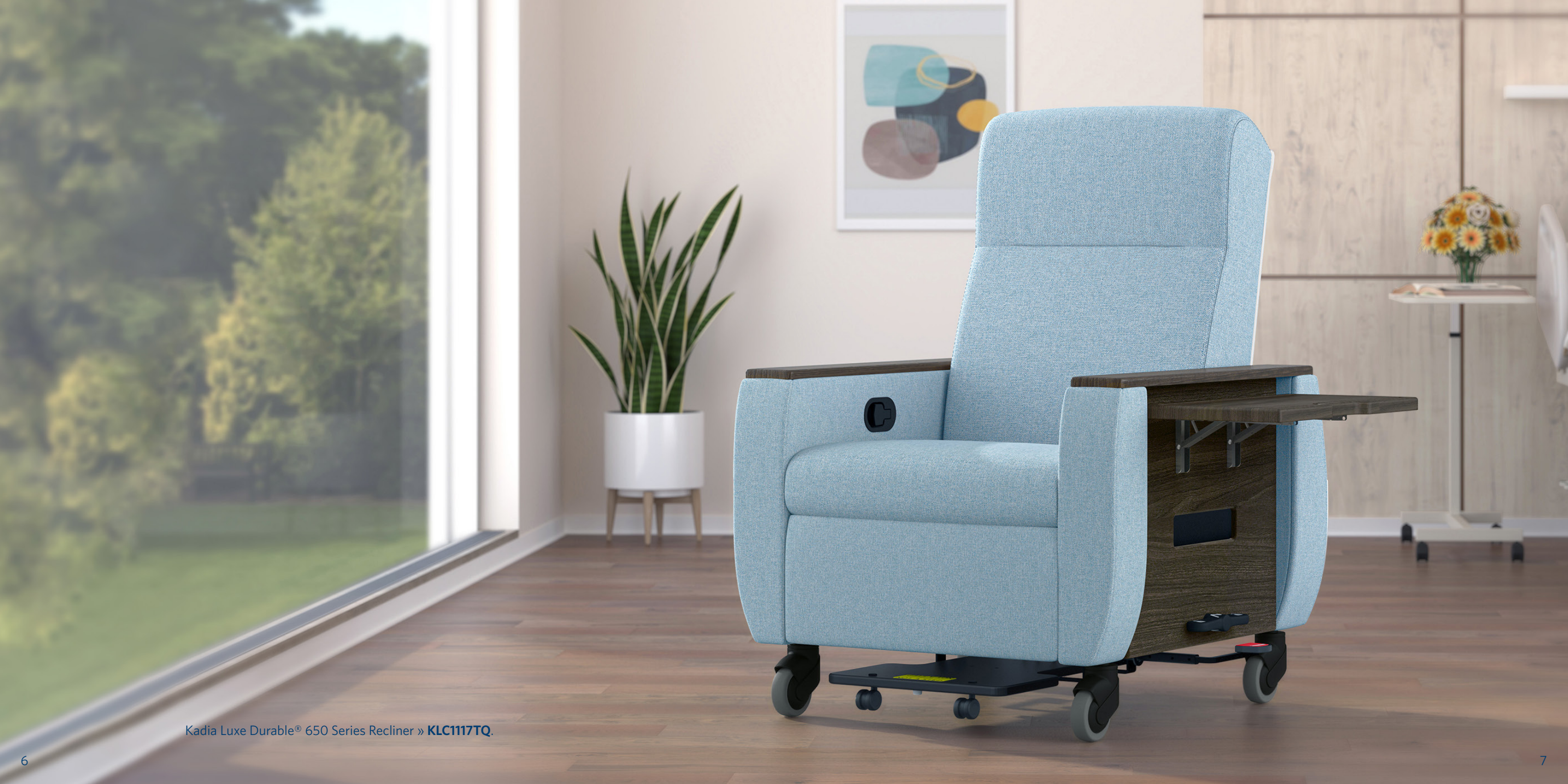
Kadia Luxe Durable® 650 Series Recliner » KLC1117TQ.