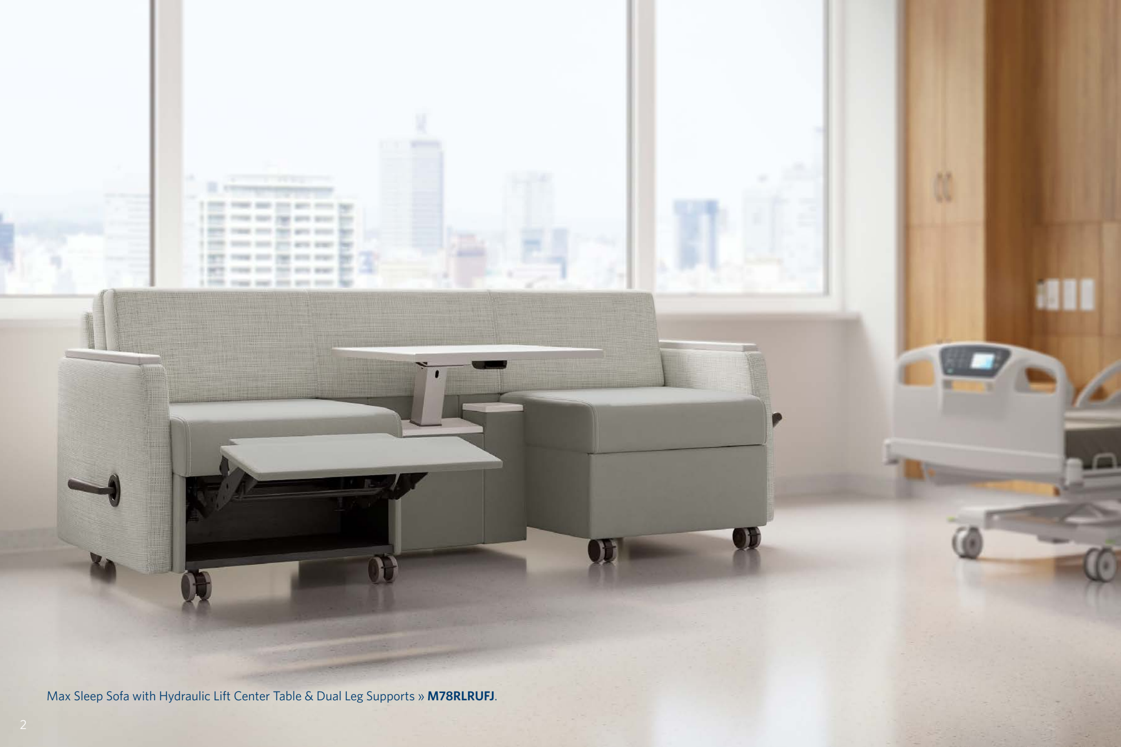
Max Sleep Sofa with Hydraulic Lift Center Table & Dual Leg Supports » M78RLRUFJ .