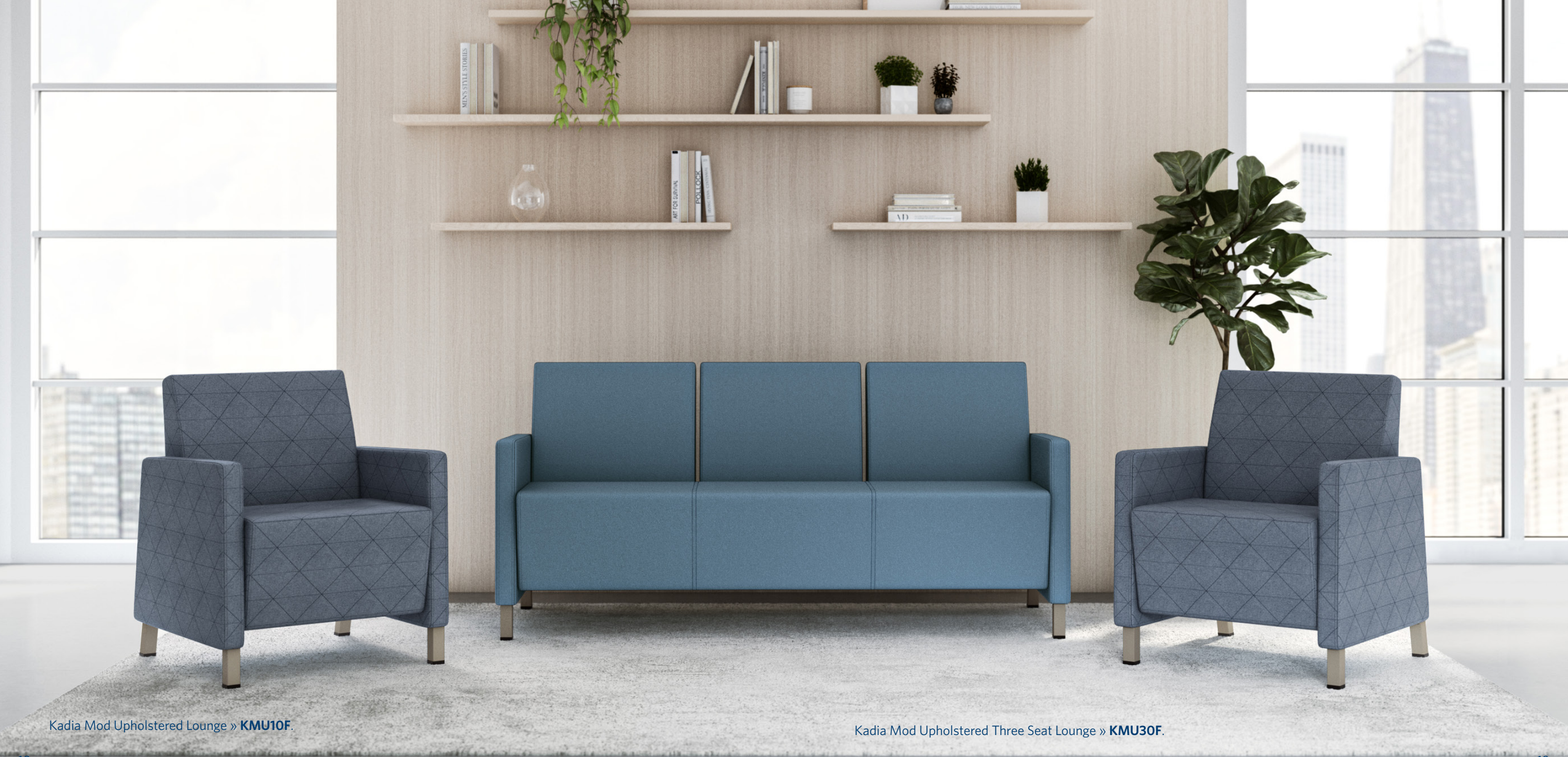
Kadia Mod Upholstered Lounge » KMU10F.