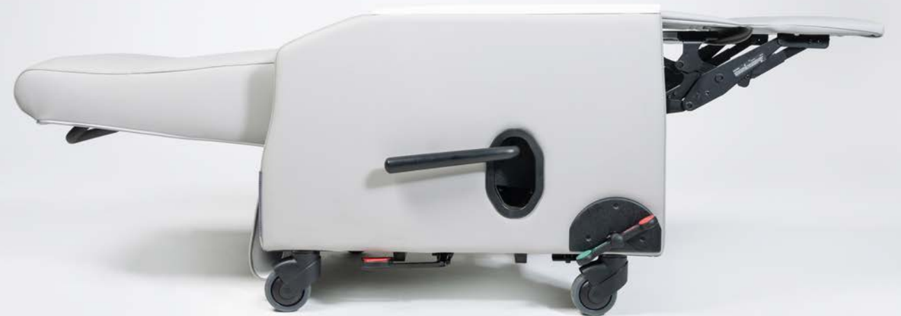
Durable® 650 Series Chaise Recliner with Patient Transfer Arm/Kadia Mod Style » KMC1167RJ.