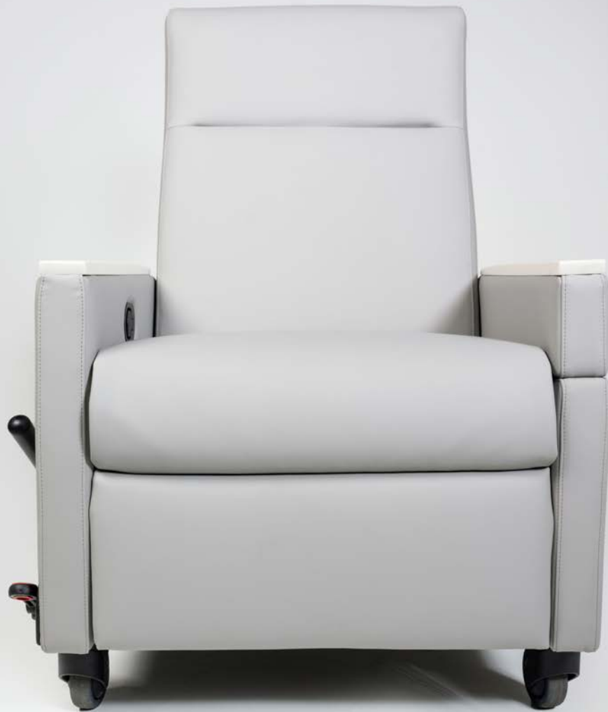
Durable® 650 Series Chaise Recliner with Patient Transfer Arm/Kadia Mod Style » KMC1167RJ.