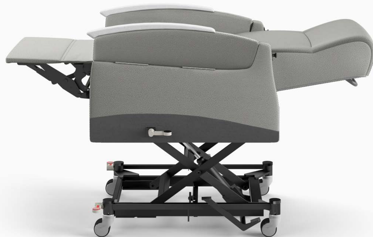
Manual Hydraulic Lift Exam Treatment Recliner with Dual Patient Transfer Arms/Rema Style » RC7M62J .