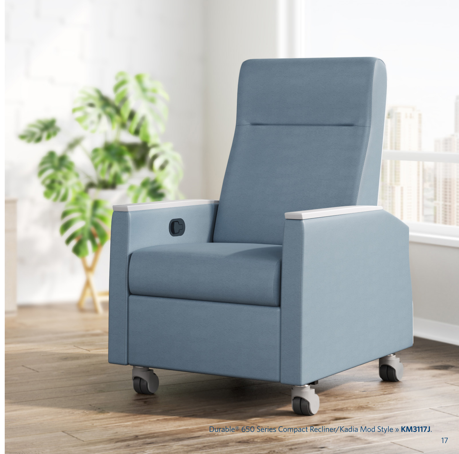
Durable® 650 Series Compact Recliner/Kadia Mod Style » KM3117J.

Our collection of Sleep Chairs offer a three position space saving design, with chair, chaise lounge, and sleep positions all available in a single product. The Sleep Chairs are available in a variety of sizes, including dual chairs with independent right and left chair/sleepers. Most models include the Soft Luxe seat cushion system with Bolsa Coils to provide a peak level of comfort and durability.