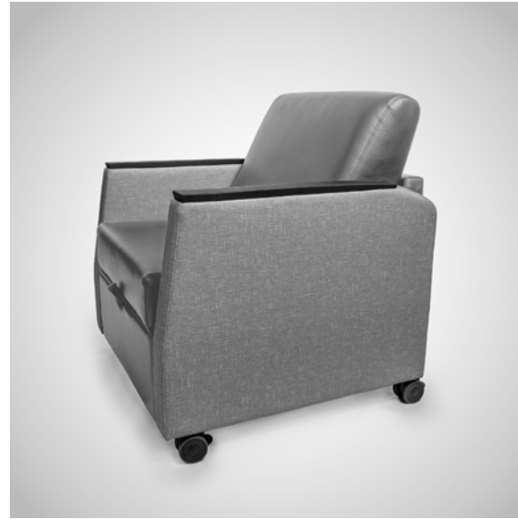
Kadia Mod Style Sleep Chair » Sitting Position