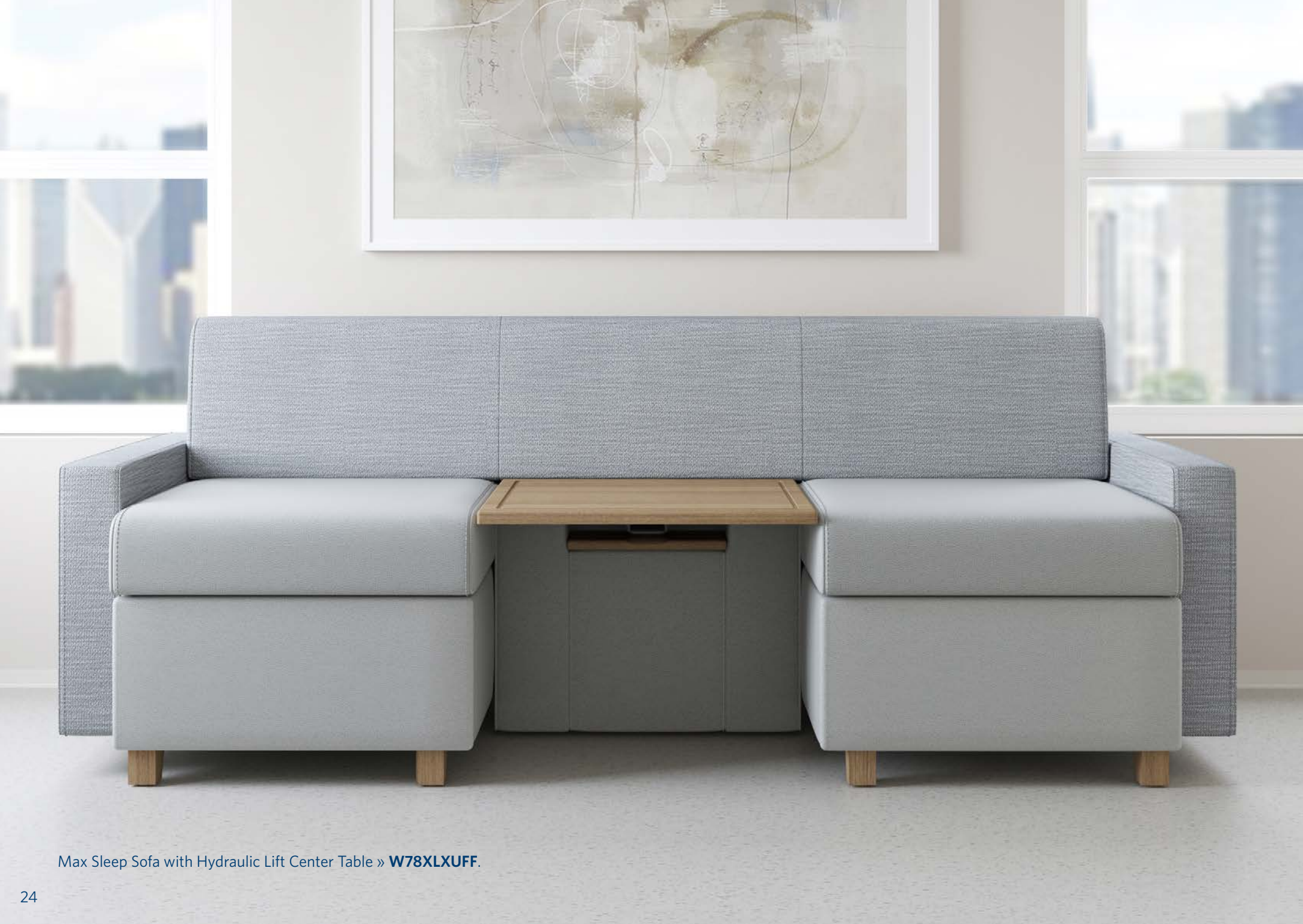
Max Sleep Sofa with Hydraulic Lift Center Table » W78XLXUFF .