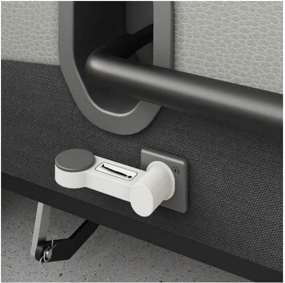
Trendelenburg Pedal (Standard)