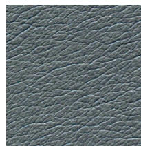
322-5976 Tin Man