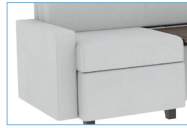
5" Square Arm