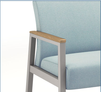
WOOD ARM CAPS