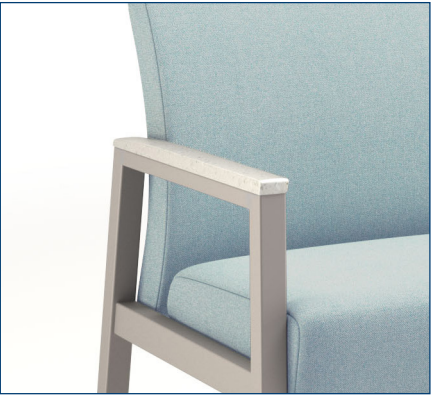
SOLID SURFACE ARM CAPS