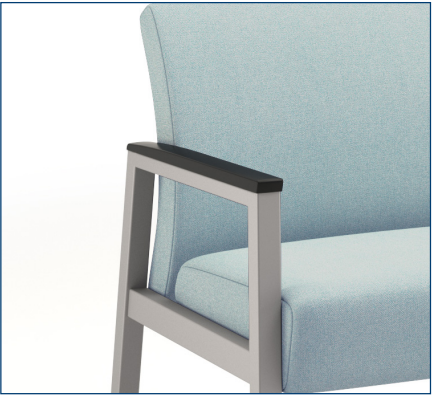
URETHANE ARM CAPS