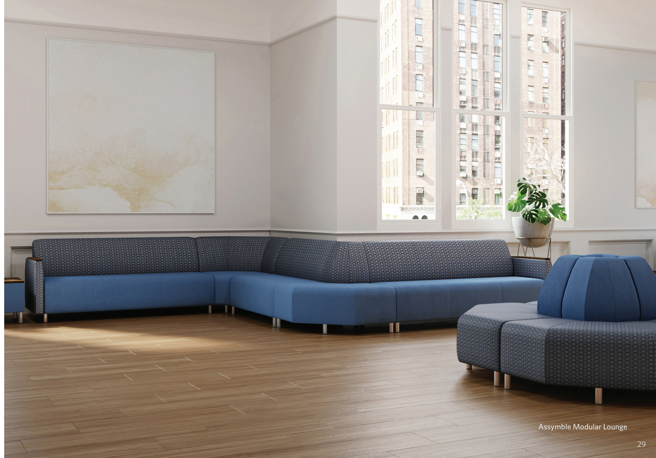
Assymble Modular Lounge

Complete with a wide array of seating, table, and angled components, along with bench and arm options, Assymble offers limitless configurations to fill any space. From serpentine layouts in open areas to wrapping around columns in tight quarters, Assymble was designed to bring maximum comfort and durability.