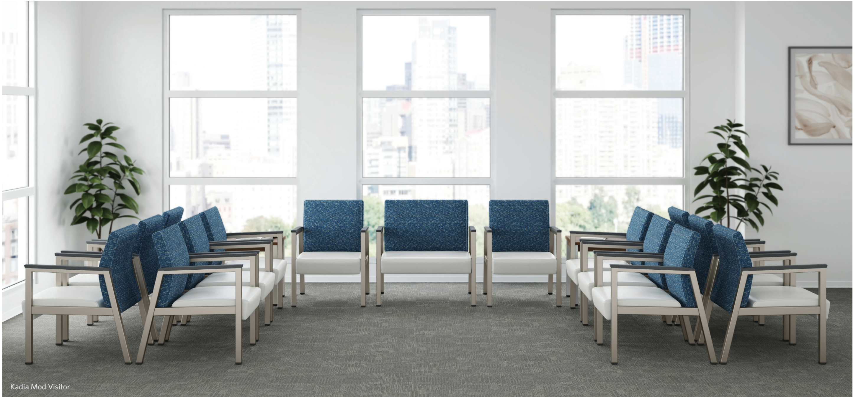
Kadia Mod Visitor