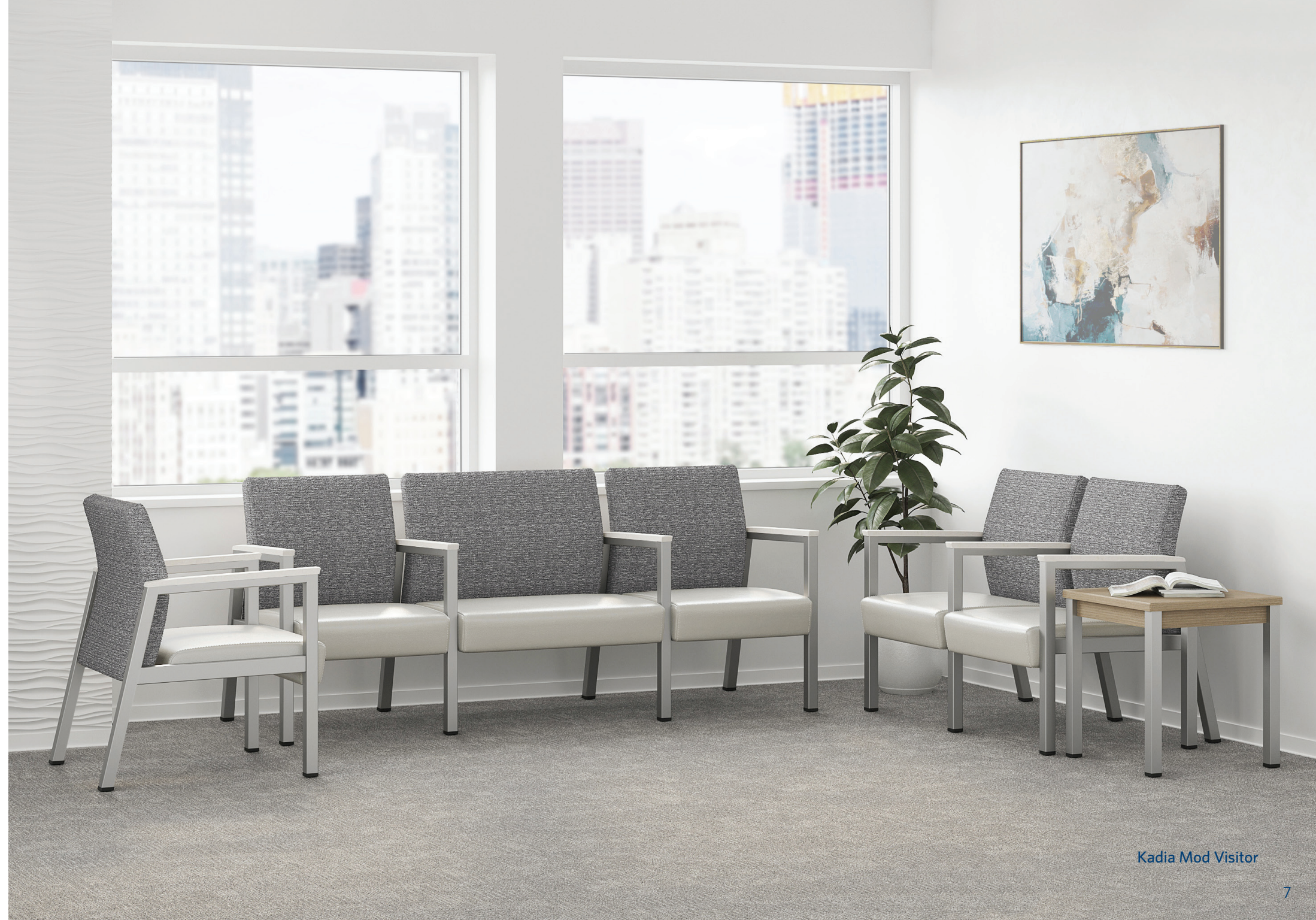
Kadia Mod Visitor

Kadia Mod is a high performing family of seating products, from metal frame visitor and lounge to easy access hip chairs, all sharing the same modern rectilinear aesthetic. Passive flex back, seat clean-out opening, and a wall saver design make Kadia Mod ideally suited for high-traffic healthcare and commercial spaces.