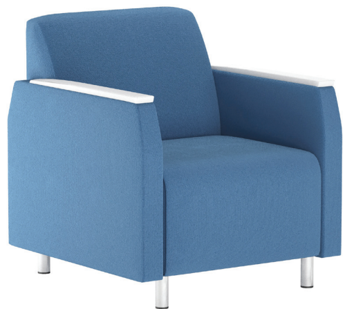
Assymble Lounge with Solid Surface Arm Caps