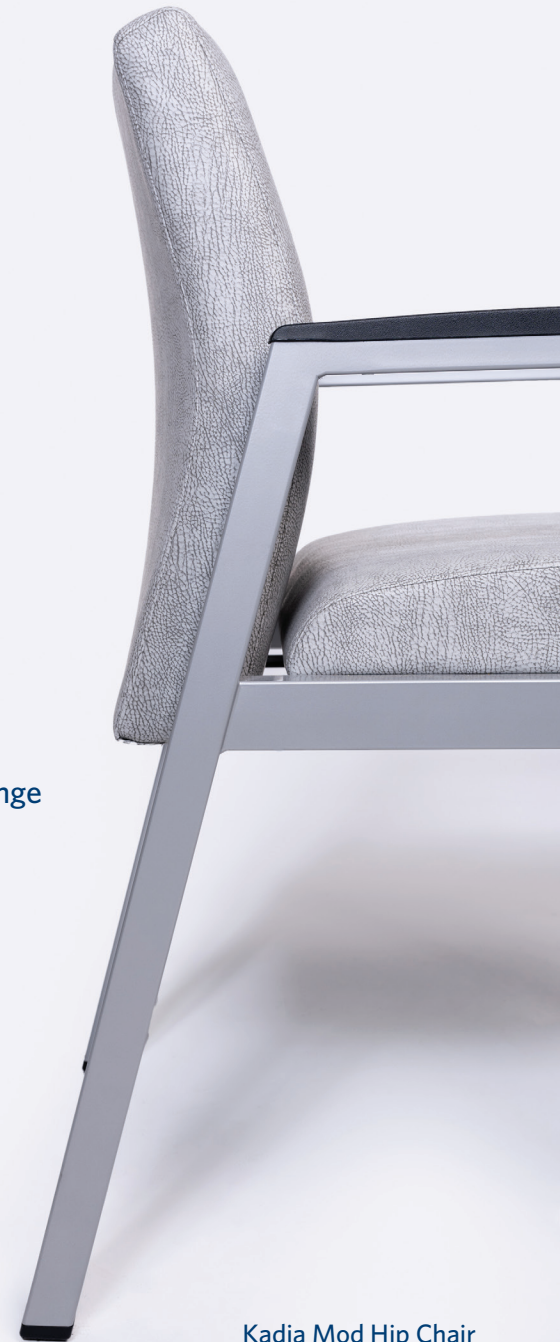
Kadia Mod Hip Chair