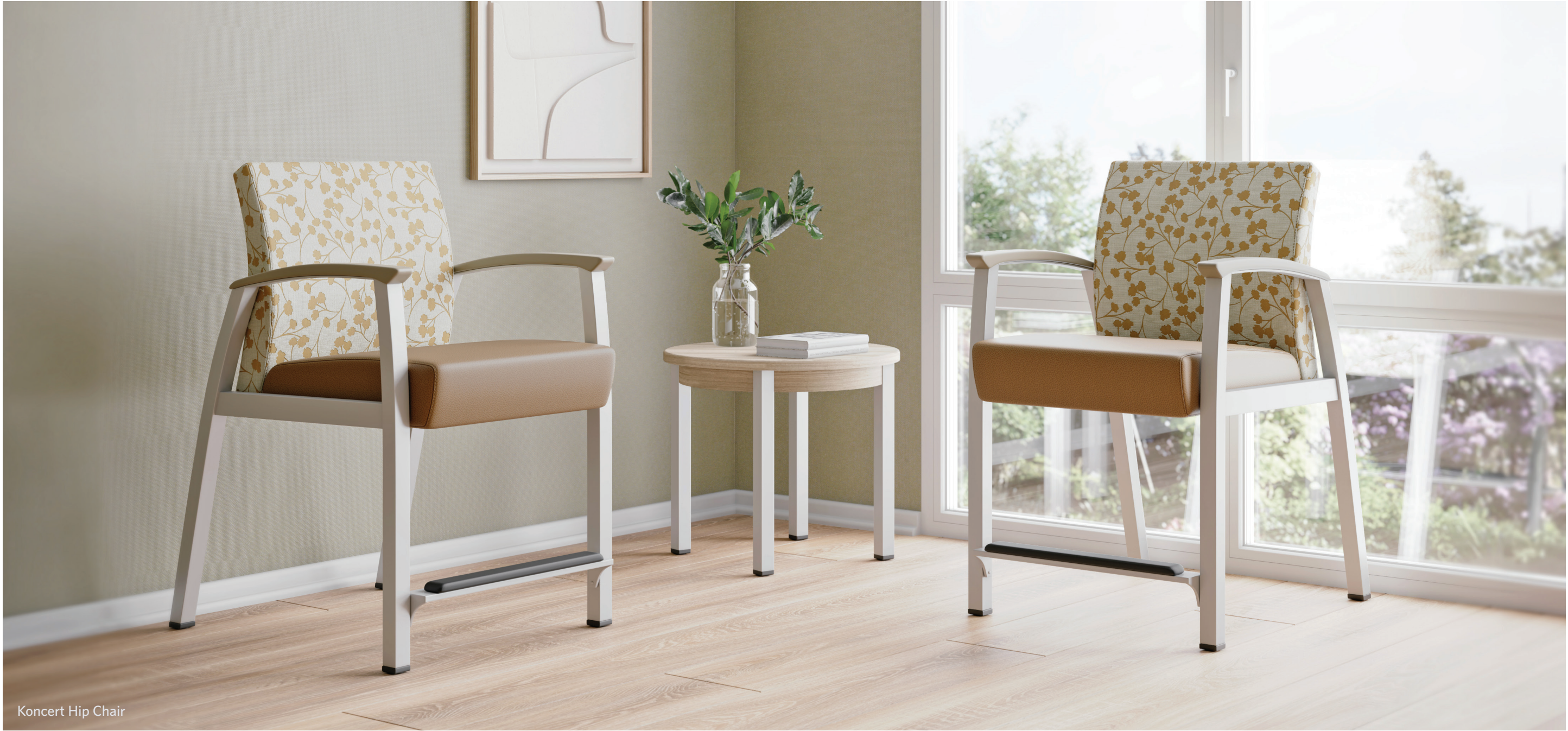
Koncert Hip Chair