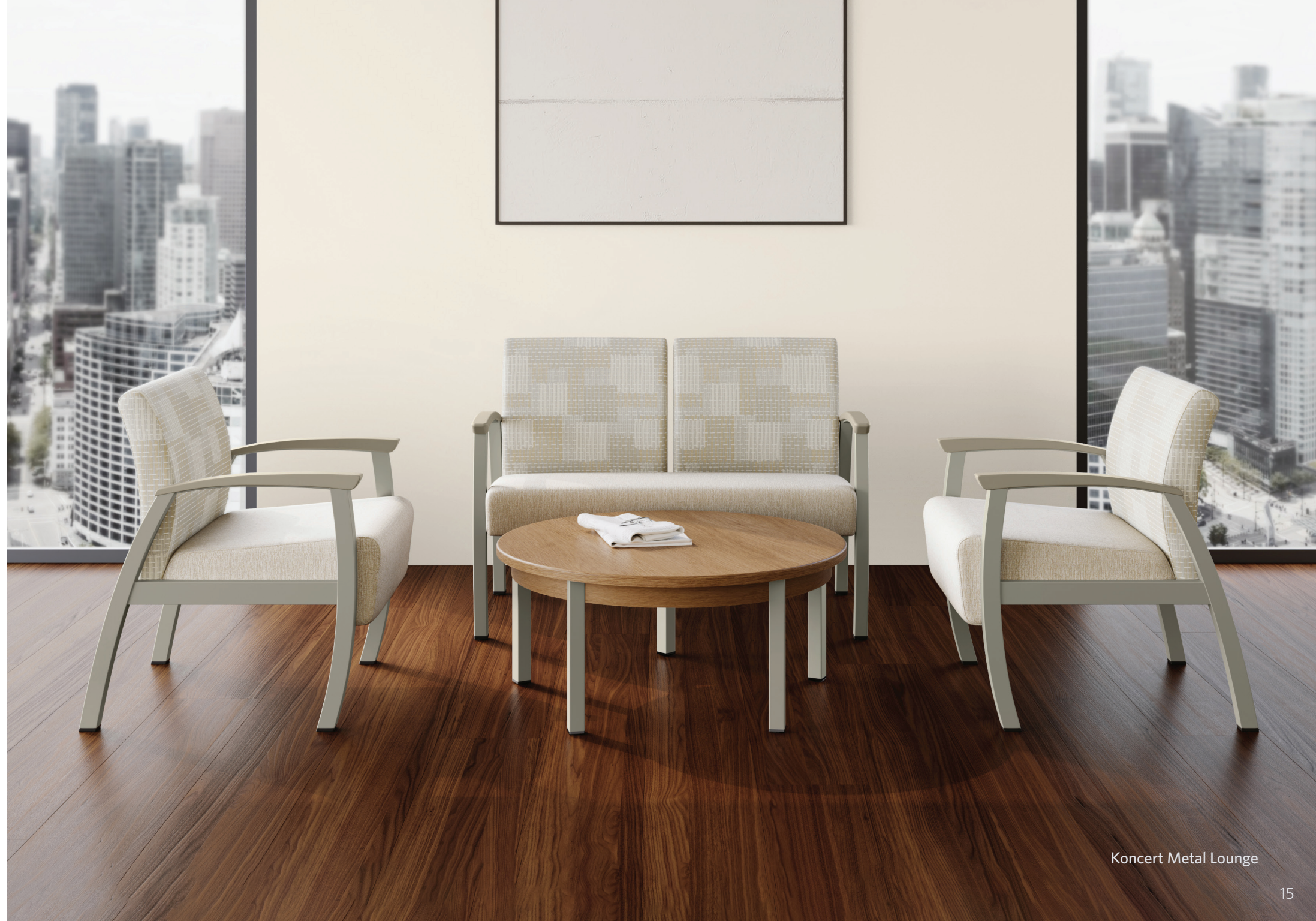
Koncert Metal Lounge

The Koncert collection of seating was designed for enhanced performance, durability, and comfort. Spanning metal frame visitor and lounge in several variations, to fully upholstered lounge and behavioral health, Koncert is a comprehensive family of seating engineered to withstand the heaviest use in public commercial and healthcare spaces.