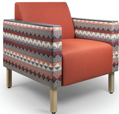
Kascade Lounge with 3.5" Arms