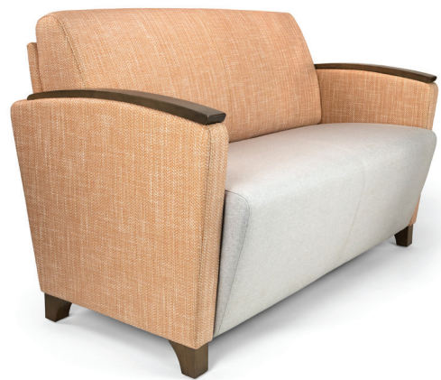
Dalton Lounge Loveseat