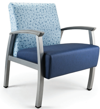
Koncert Metal Lounge