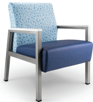
Kadia Mod Metal Lounge