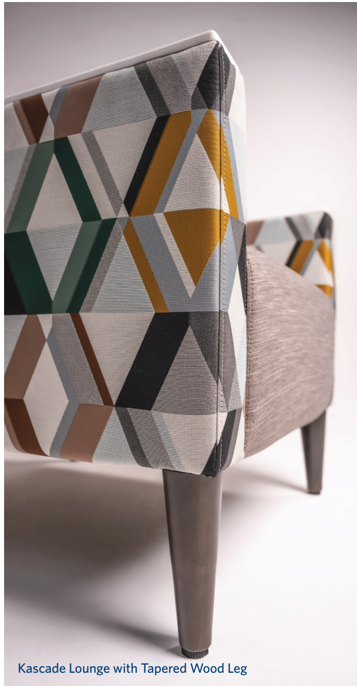
Kascade Lounge with Tapered Wood Leg