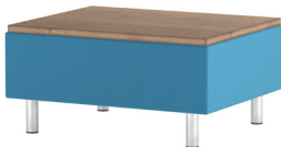
AST10 | Table

*Available in single seat, 2 seat, and 3 seat