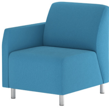
AS12LF / AS12RF | Single Seat Left / Right Arm (Facing)

*Available in single seat, 2 seat, and 3 seat