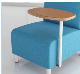
PIVOT POLE TABLE

*Models with arms have power option on side of arm