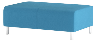
ASB3048 | 30" Depth Two Seat Bench (Also available in 24" depth)

*Available in single seat, 2 seat, and 3 seat