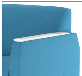
SOLID SURFACE ARM CAPS