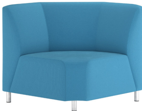
AS90IC | 90 Degree Inside Corner

*Available in single seat, 2 seat, and 3 seat, with arm on either side