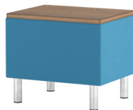
AST15 | End Table