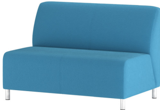
AS20N | 2 Seat Armless

*Available in single seat, 2 seat, and 3 seat