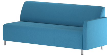
AS32RF | 3 Seat Right Arm (Facing)

*Available in single seat, 2 seat, and 3 seat