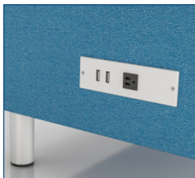
POWER INSTALLED ON FRONT CENTER OF SEAT

*Models with arms have power option on side of arm