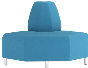
AS90OC | 90 Degree Outside Corner