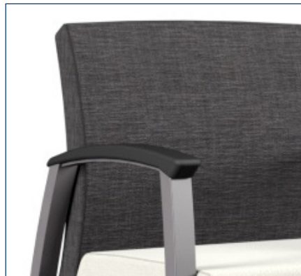
URETHANE ARM CAPS