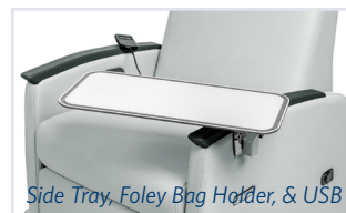
Side Tray, Foley Bag Holder, & USB