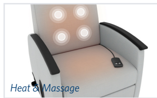
Heat & Massage