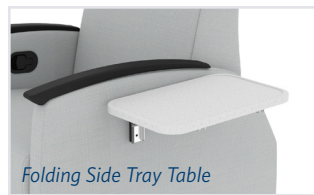
Folding Side Tray Table