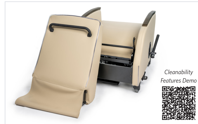
Cleanability Features Demo

A full range of add-ons allow Durable® recliners to be tailored to nearly any setting. Healthcare specific accessories such as IV poles and comfort options like heat/massage or USB charging enhance both wellness and patient experience. Many options can even be added in the field, years after purchase.