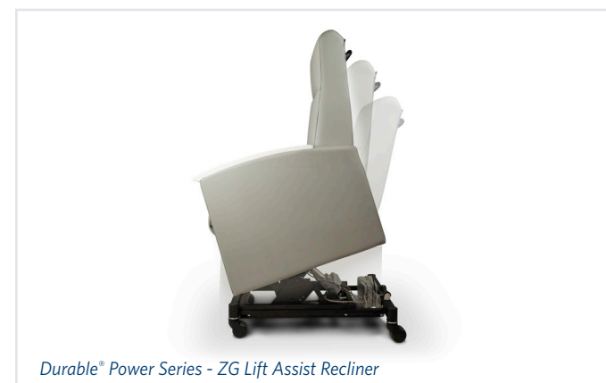
Durable® Power Series - ZG Lift Assist Recliner

Numerous features are available across the different Durable® series to protect patients, such as central locking caster systems and patient transfer arms. Exam lift and power recliners also reduce caregiver strain by moving patients to the most ergonomic position for the particular attending staff.