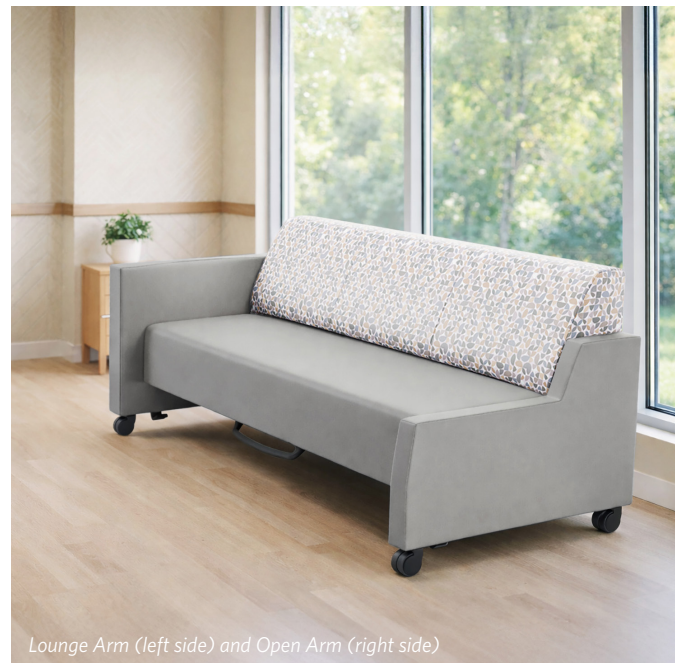
Lounge Arm (left side) and Open Arm (right side)

A selection of finishes across thermofoil, urethane, and solid surface arm cap materials 1 complement thousands of healthcare grade textile choices for a cohesive, design-forward solution.