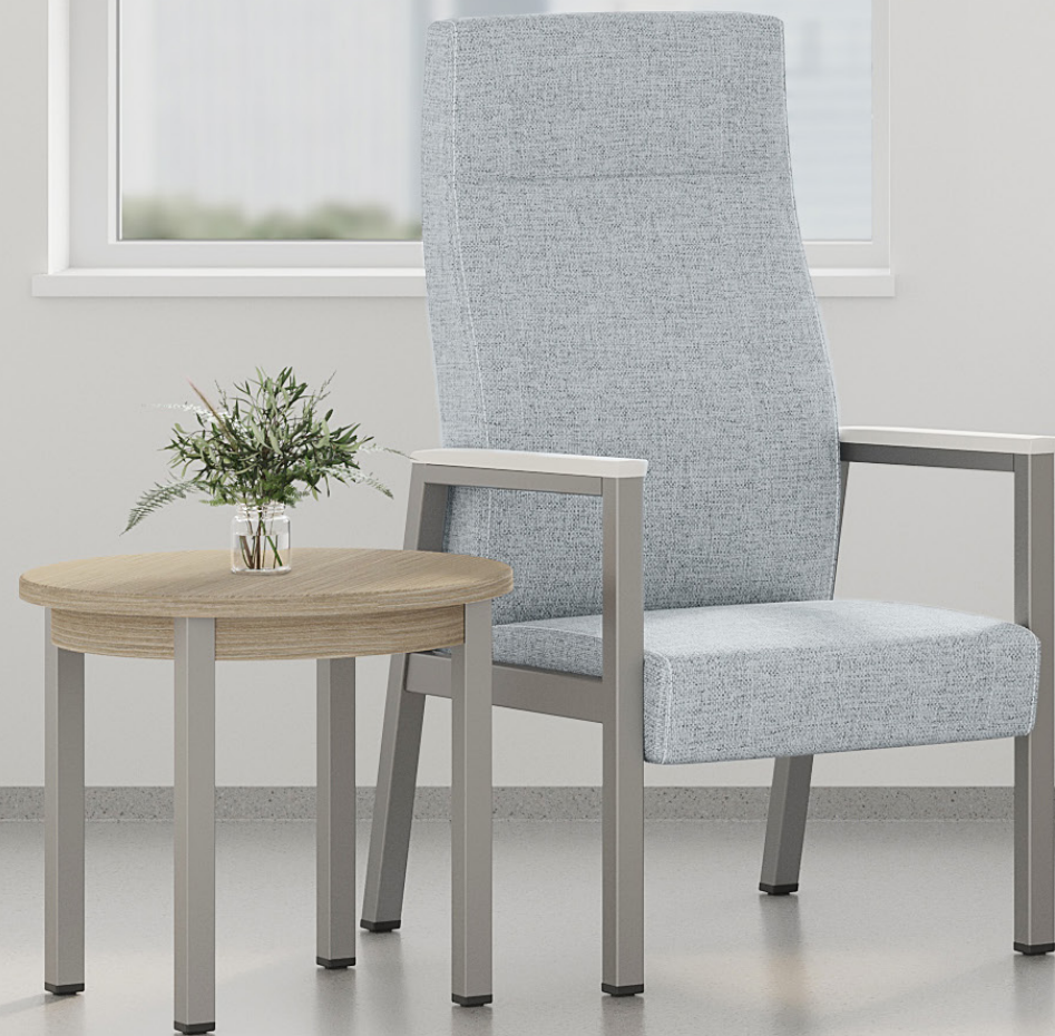
Koncert Table » KOT24R.