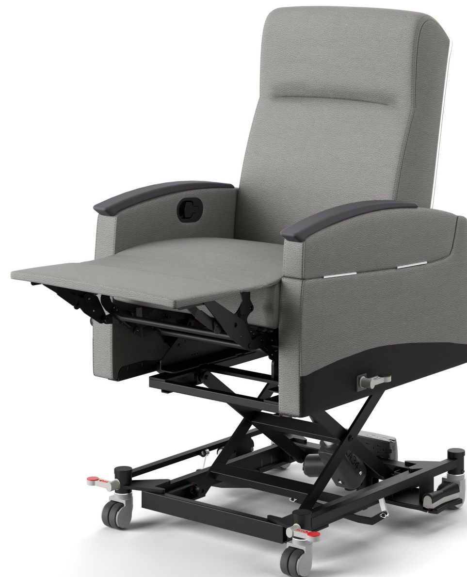
Power Lift Exam Recliner/Rema Style » RC7P67RU.