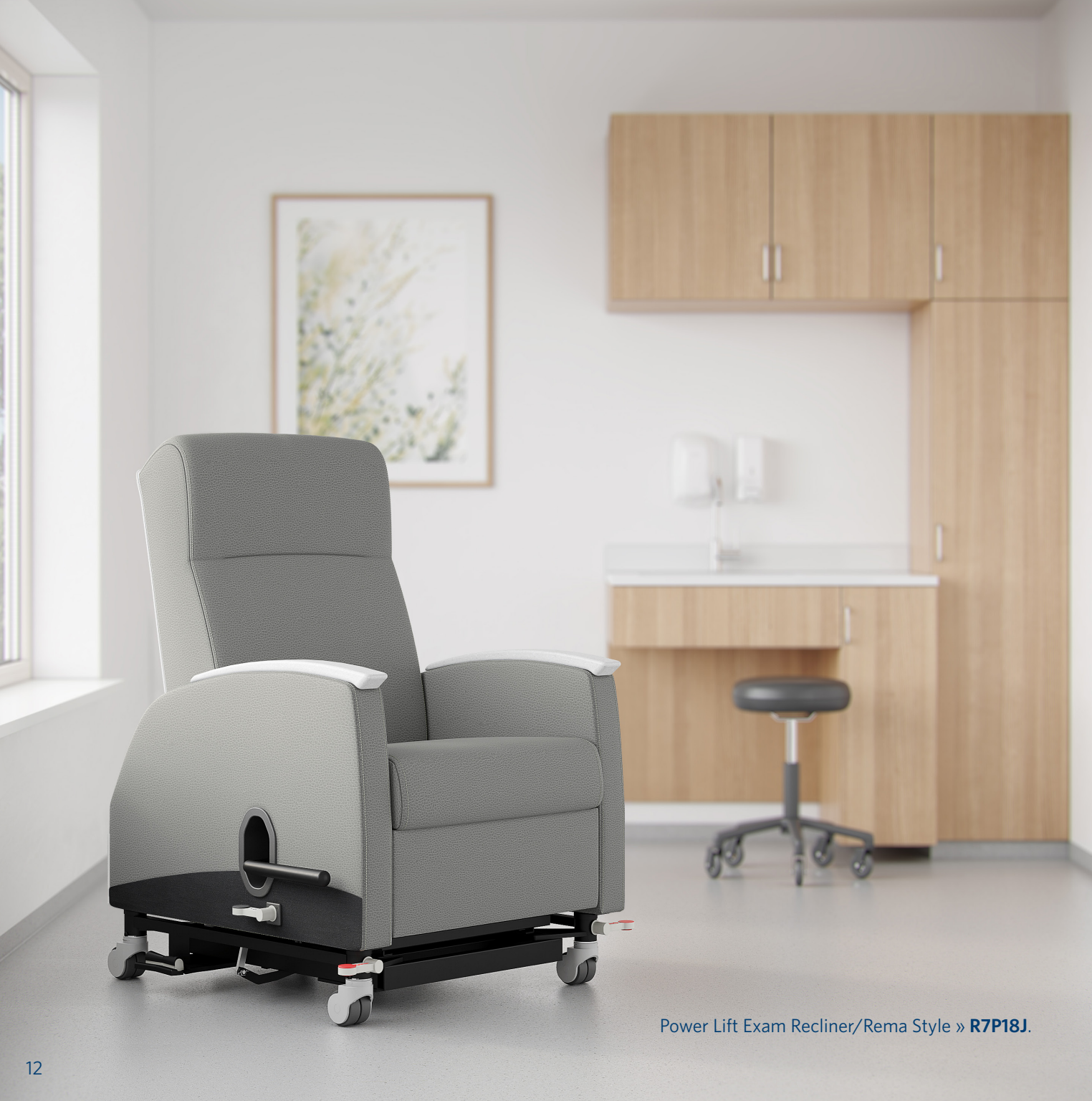
Power Lift Exam Recliner/Rema Style » R7P18J .