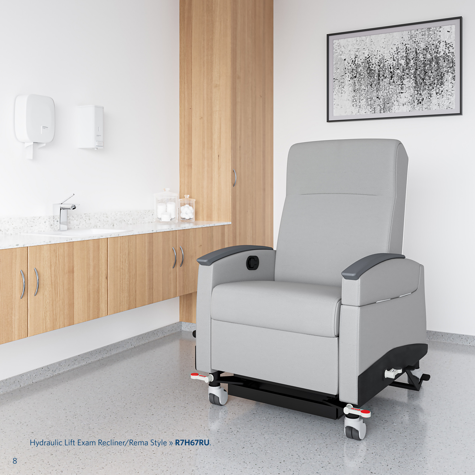
Hydraulic Lift Exam Recliner/Rema Style » R7H67RU .