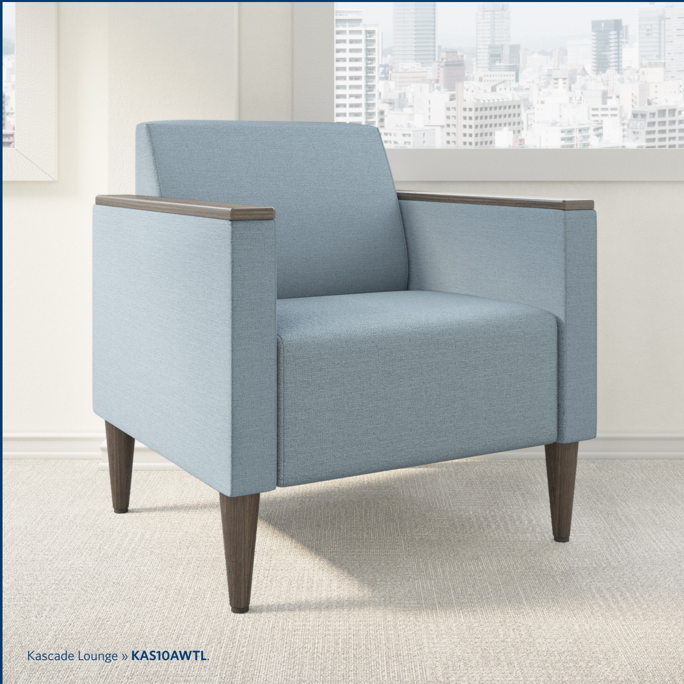
Kascade Lounge » KAS10AWTL