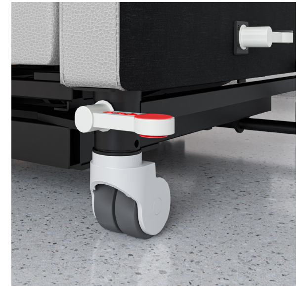
Quad Locking Foot Pedal & 3" Dual Wheel Caster