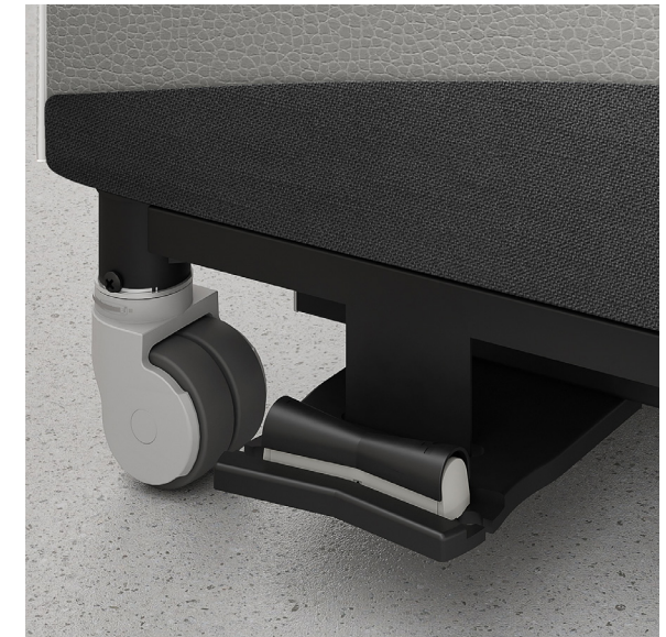
Power Lift Exam Activation Pedal