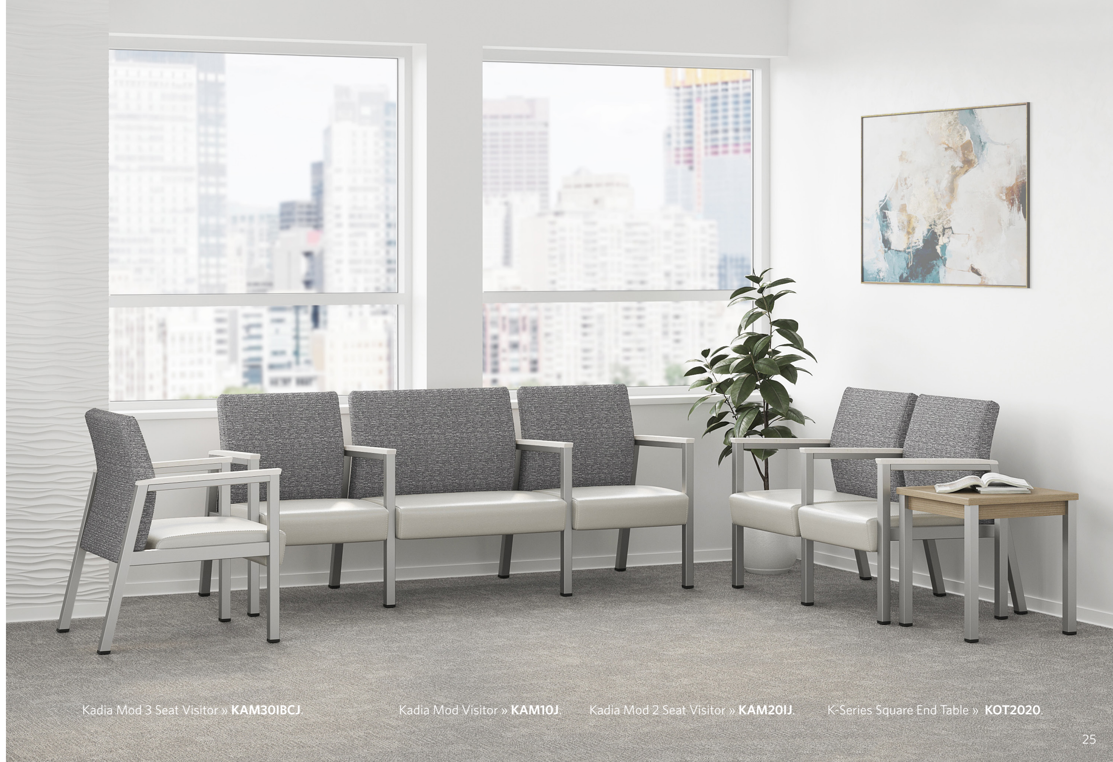
Kadia Mod 3 Seat Visitor » KAM30IBCJ

The re-imagined Kadia Mod has been engineered with clean lines, refreshing comfort, enhanced performance, and lifetime durability that you have come to expect from Knú Comfort®. The Kadia Mod Series features a molded foam seat which allows for exceptional comfort coupled with consistency in look and feel from one seat to the next in a public area setting. The Kadia Mod has a passive flex back integrated into the design, which allows for a slightly noticeable minor flexing of the back, which again provides added comfort as a standard. The Kadia Mod Series is a full family of products that has an integrated “wall saver” leg design, adjustable leveling glides, three standard powder coat frame colors, and unlimited color options available upon request. Urethane and Solid Surface Arm Cap options are available, as well as replaceable components should an update or reconfiguration be needed in the future.