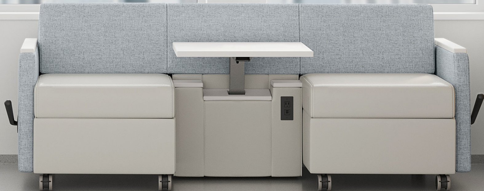
Max Sleep Sofa with Hydraulic Lift Center Table [Patent-Pending] & Dual Leg Supports » MM1878UFJ.