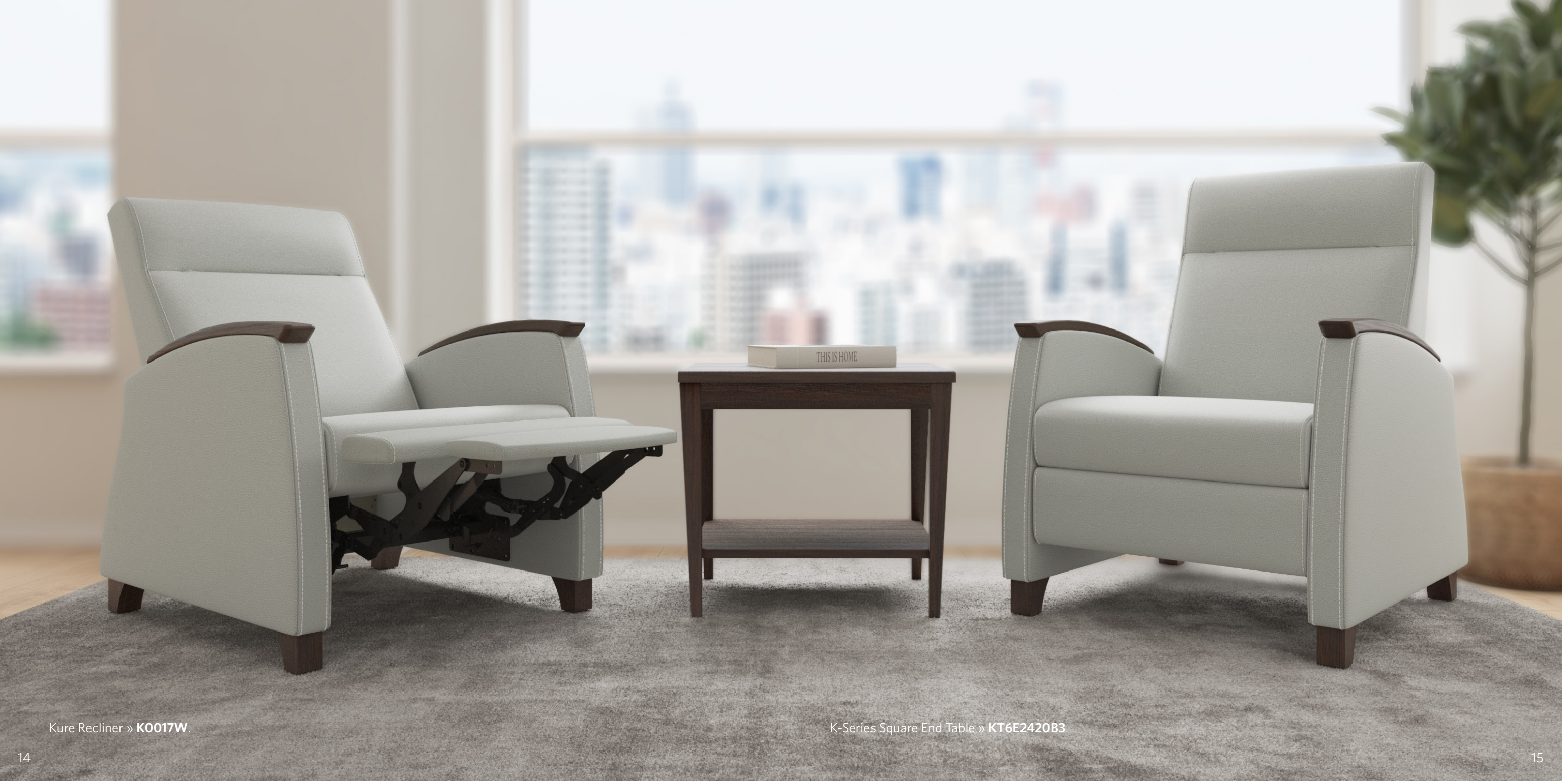
Kure Recliner » K0017W.