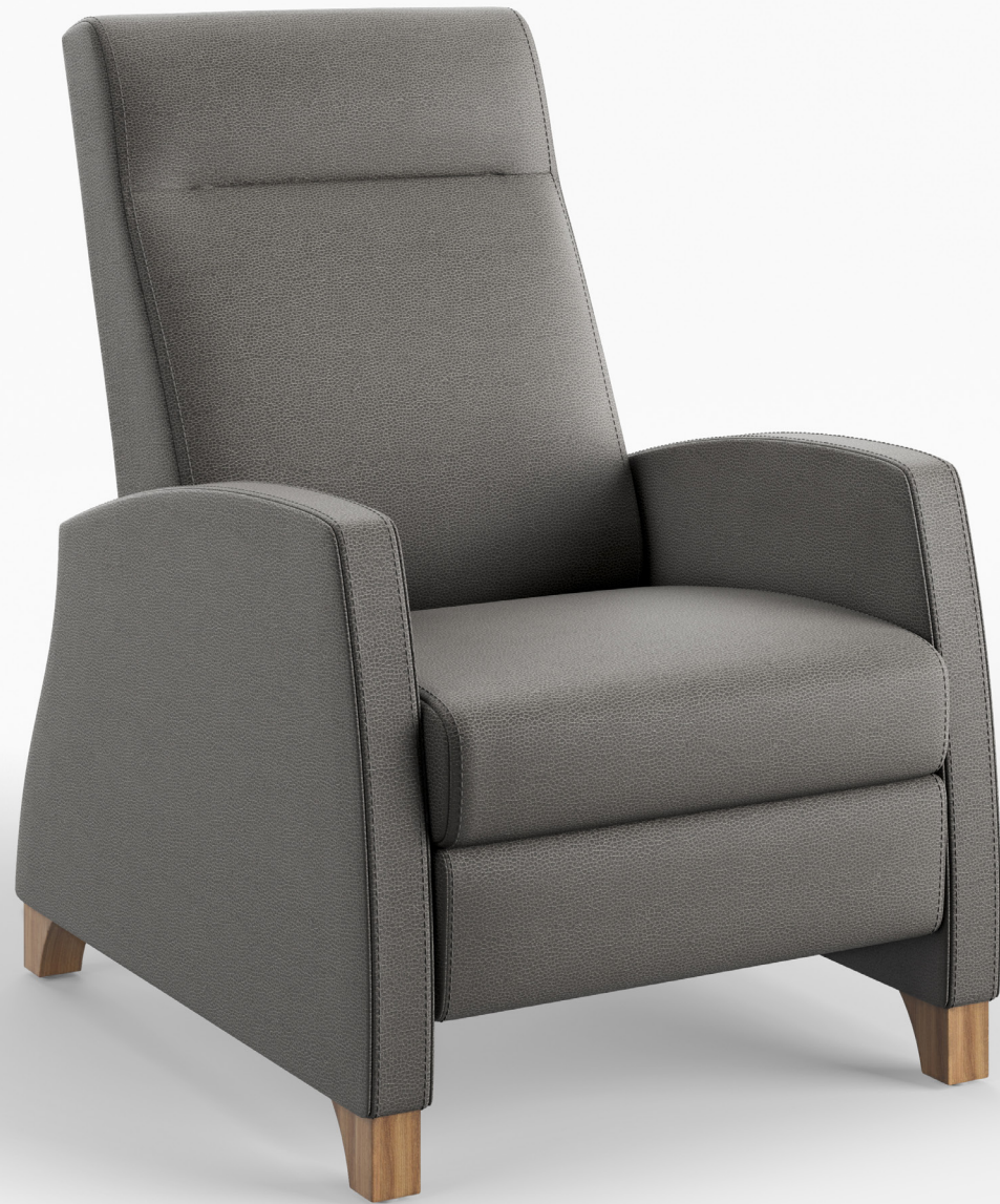
Kure Recliner » K0017F.