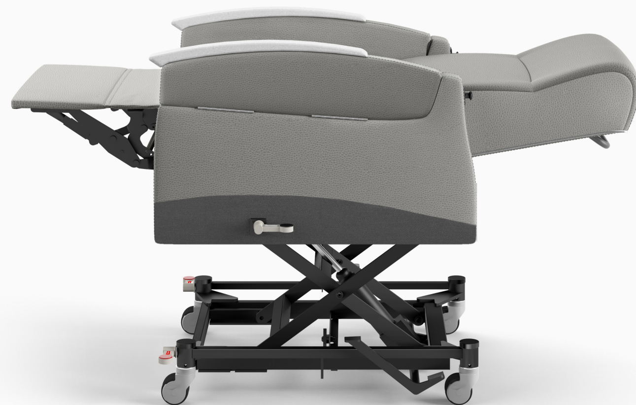
Hydraulic Lift Exam Recliner/Rema Style » RC7H62J .