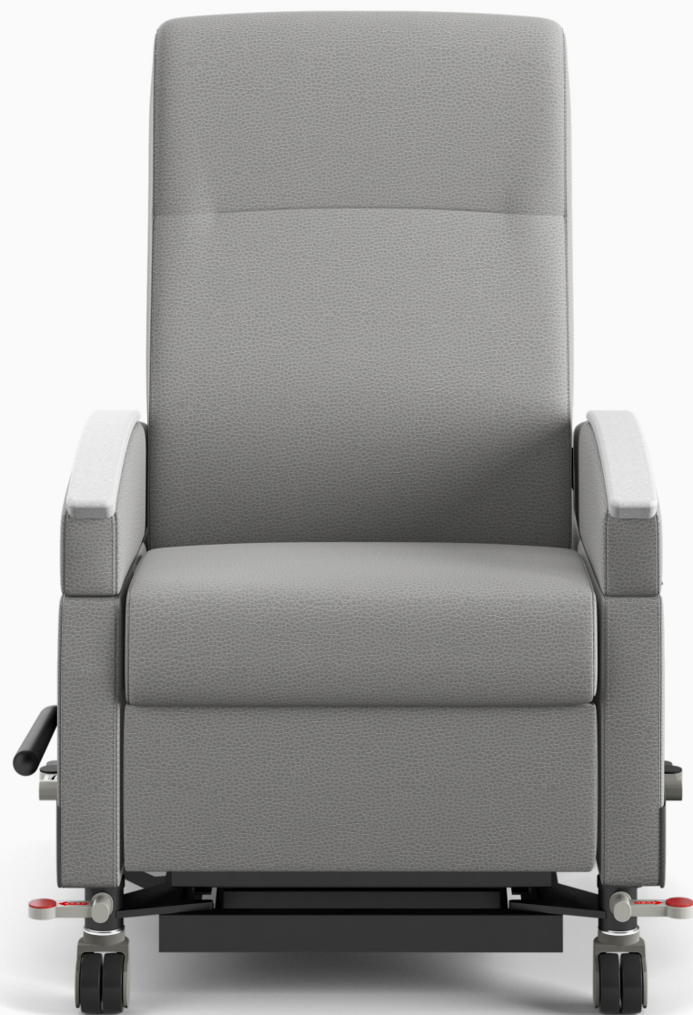
Hydraulic Lift Exam Recliner/Rema Style » R7H62J .