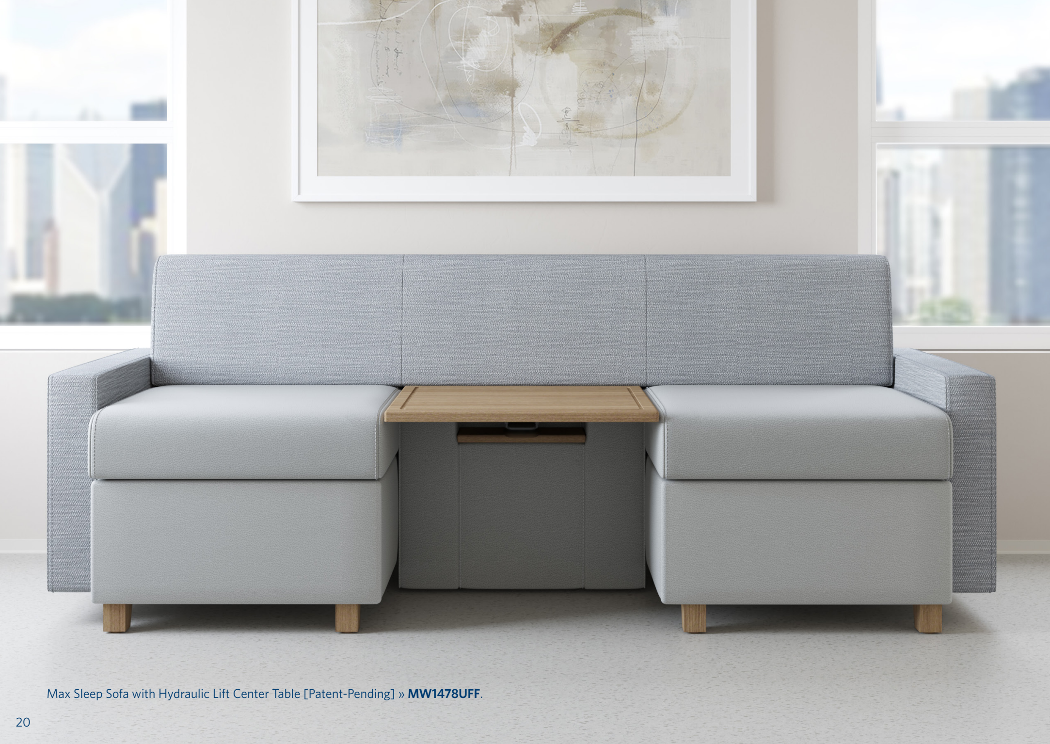
Max Sleep Sofa with Hydraulic Lift Center Table [Patent-Pending] » MW1478UFF .