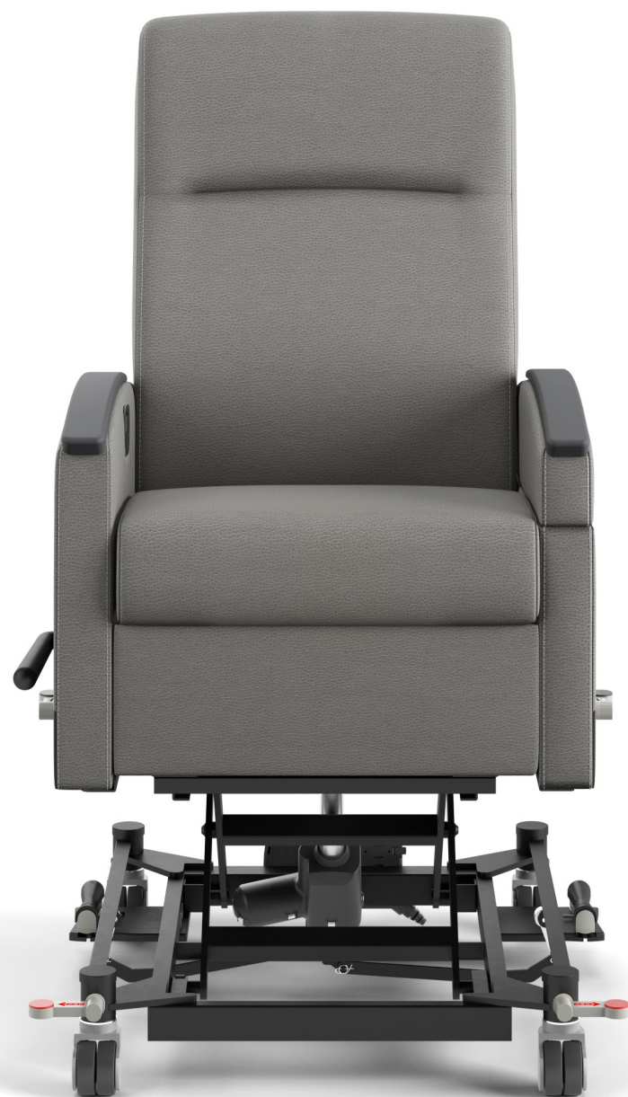
Power Lift Exam Recliner/Rema Style » R7P67RU.