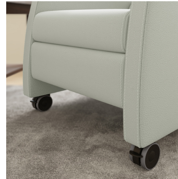
3" Dual Wheel Caster