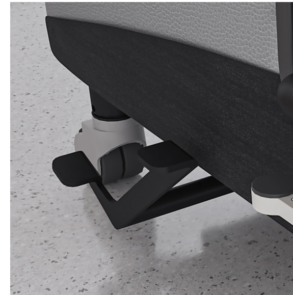
Hydraulic Pedal (Left Side Facing) & Ballistic Nylon Protection