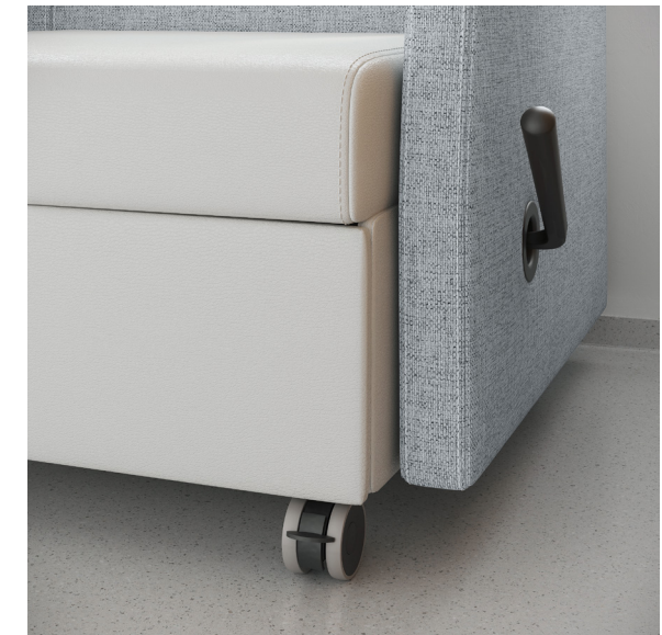
3" Dual Wheel Caster