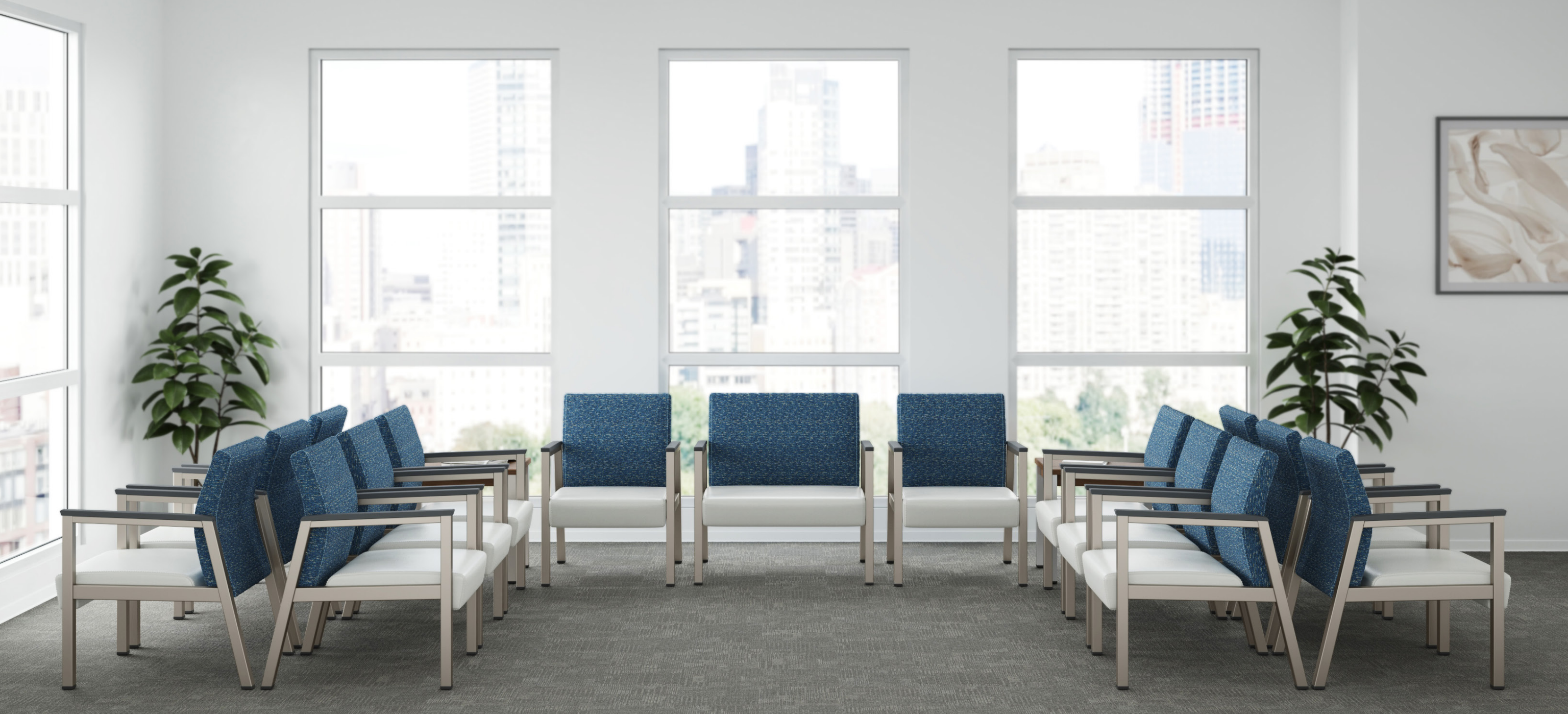
Kadia Mod Visitor » KAM10U.