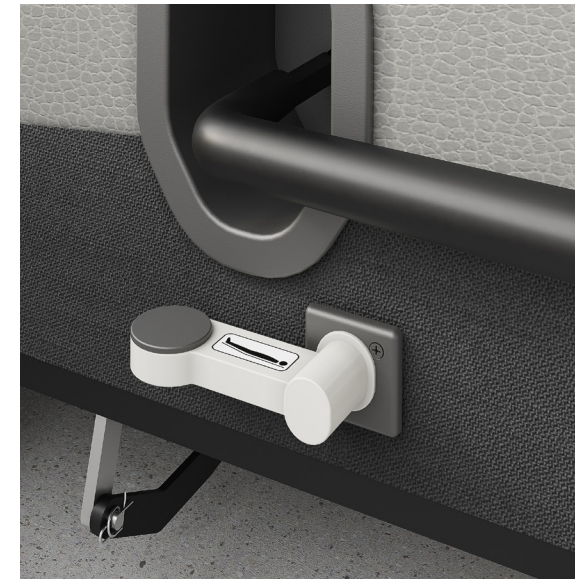
Standard Trendelenberg Pedal