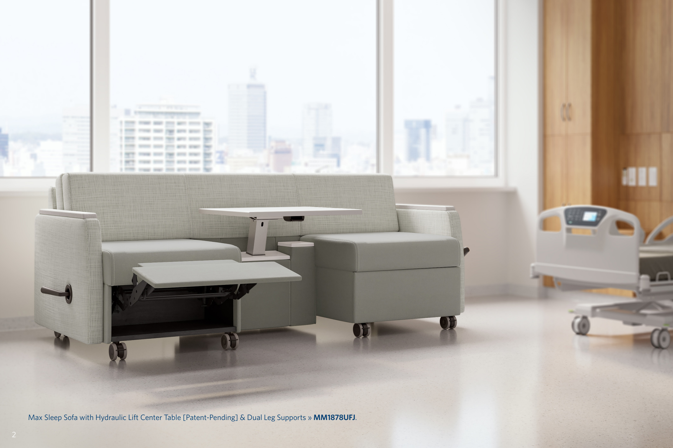
Max Sleep Sofa with Hydraulic Lift Center Table [Patent-Pending] & Dual Leg Supports » MM1878UFJ .