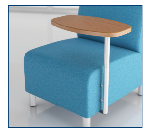
PIVOT POLE TABLE *Available on armless models only