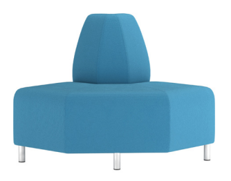
AS90OC | 90 Degree Outside Corner