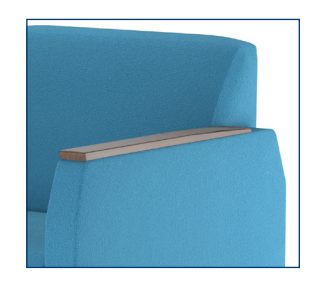
WOOD ARM CAPS