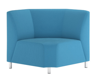
AS90IC | 90 Degree Inside Corner