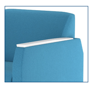
SOLID SURFACE ARM CAPS