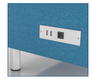
POWER INSTALLED ON FRONT CENTER OF SEAT *Models with arms have power option on side of arm