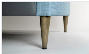
Wood Tapered Leg