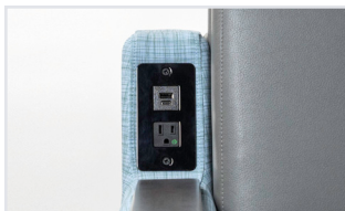
Optional Hospital Grade Power