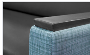
Solid Surface Arm Cap