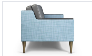
3.5" Contoured Arm Profile

A 3.5" contoured arm and 5" square arm are available, with an 8" arm arriving Summer 2024. Arms can be specified in any combination to meet your spacial and functional needs.