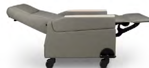
True Flatbed Sleep Position