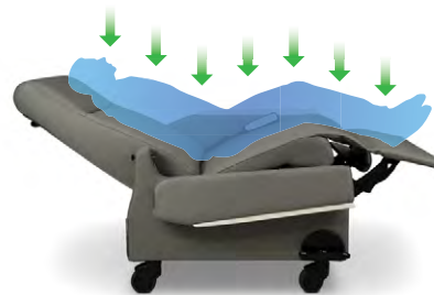
Pressure is evenly distributed in zero gravity position (arm folded down for visibility)

The same neutral body posture science is the basis for the zero gravity position capability incorporated into Durable® Power Series recliners. As the three axes of movement gently recline the user back, the position relieves the strain on muscles and joints caused by gravity through equalizing the distribution of weight across the entire body. When positioned in the zero gravity position, users experience a sense of weightlessness similar to what astronauts feel in the microgravity of space.