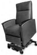
ZG Lift Assist Recliner