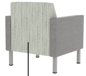
IB - Inside Back (KAS10, KAS20, KAS30)

**KAS10, KAS20, KAS30 models do not have outside back**