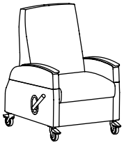
E1042 | E1142* 33.5" Overall Width