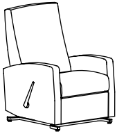
EV | E1306 | EC1306 30.75" Overall Width