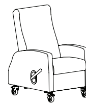
(Koncert style pictured)