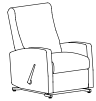
(Koncert style pictured)