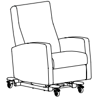
(Koncert style pictured)