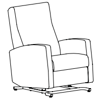
(Koncert style pictured)