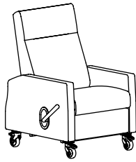
KM1017 | KM1117 33" Overall Width