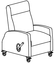
R1118 33.5" Overall Width