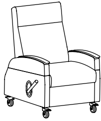
R1042 | R1142* 33.5" Overall Width