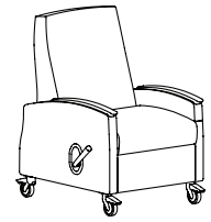
Single Fold Down Arm