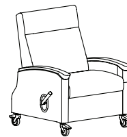
Single Removable Arm