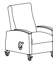
Single Fold Down Arm (Koncert style pictured)