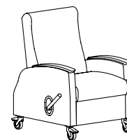
Single Removable Arm (Koncert style pictured)

Select Functional Style (Aesthetic style code precedes selected model number below, e.g., KC117)