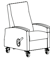
Single Fold Down Arm (Koncert style pictured)